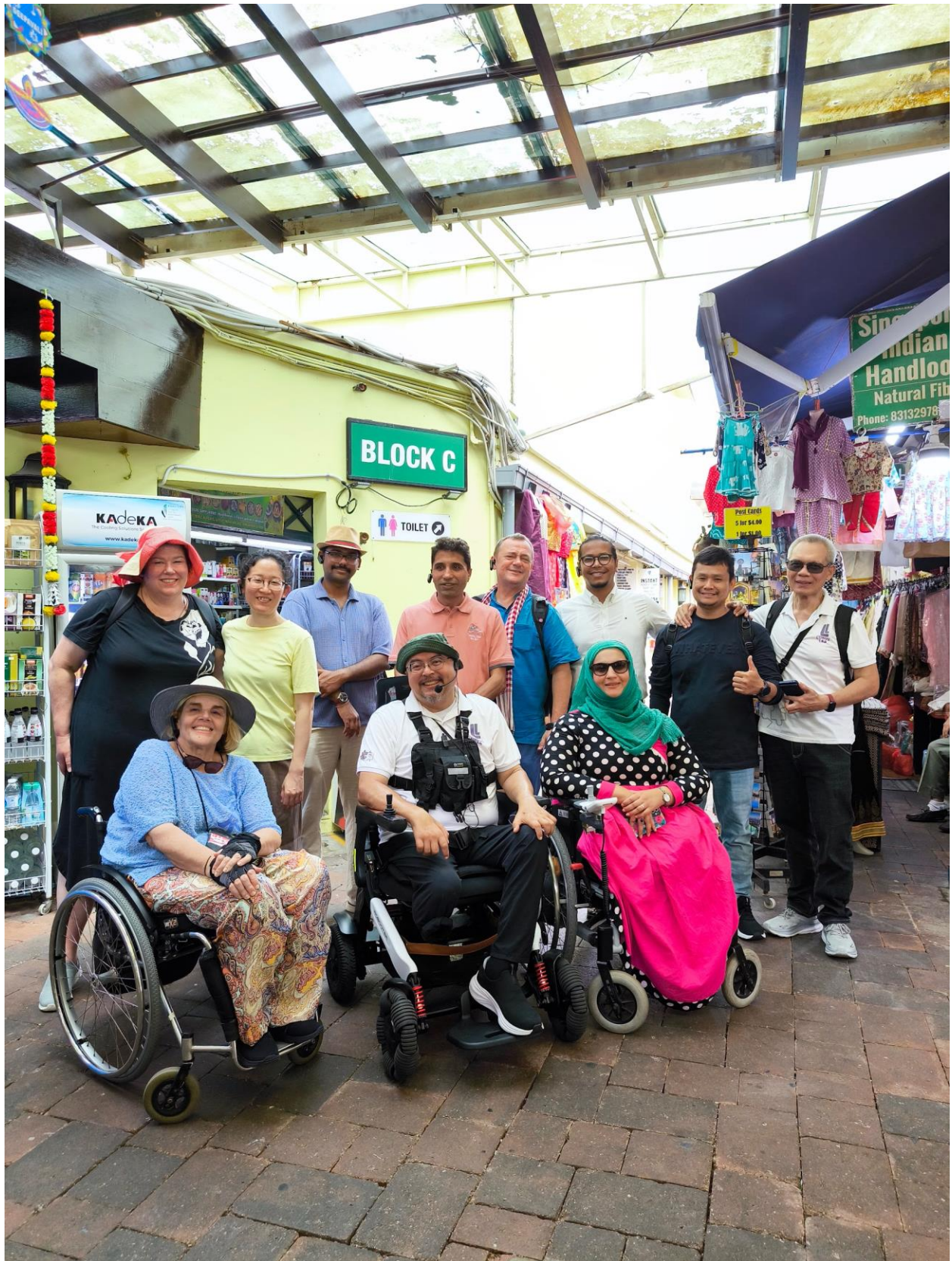
Image caption: Enabling Village resident guides with disabilities from Ludus Lab began