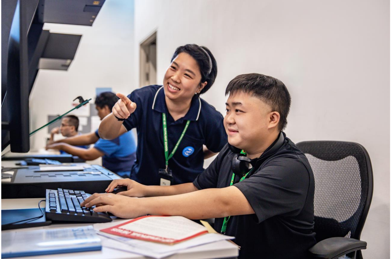
Image caption: At E2C, a job coach trains a client in hard and soft skills, such as digitalisation, and communication skills.