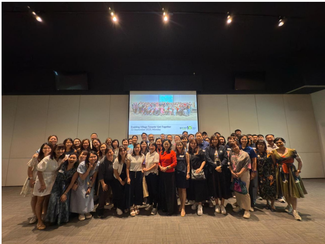
Image caption: Celebrating partnership and community at Enabling Village Tenant Get-Together sessions.