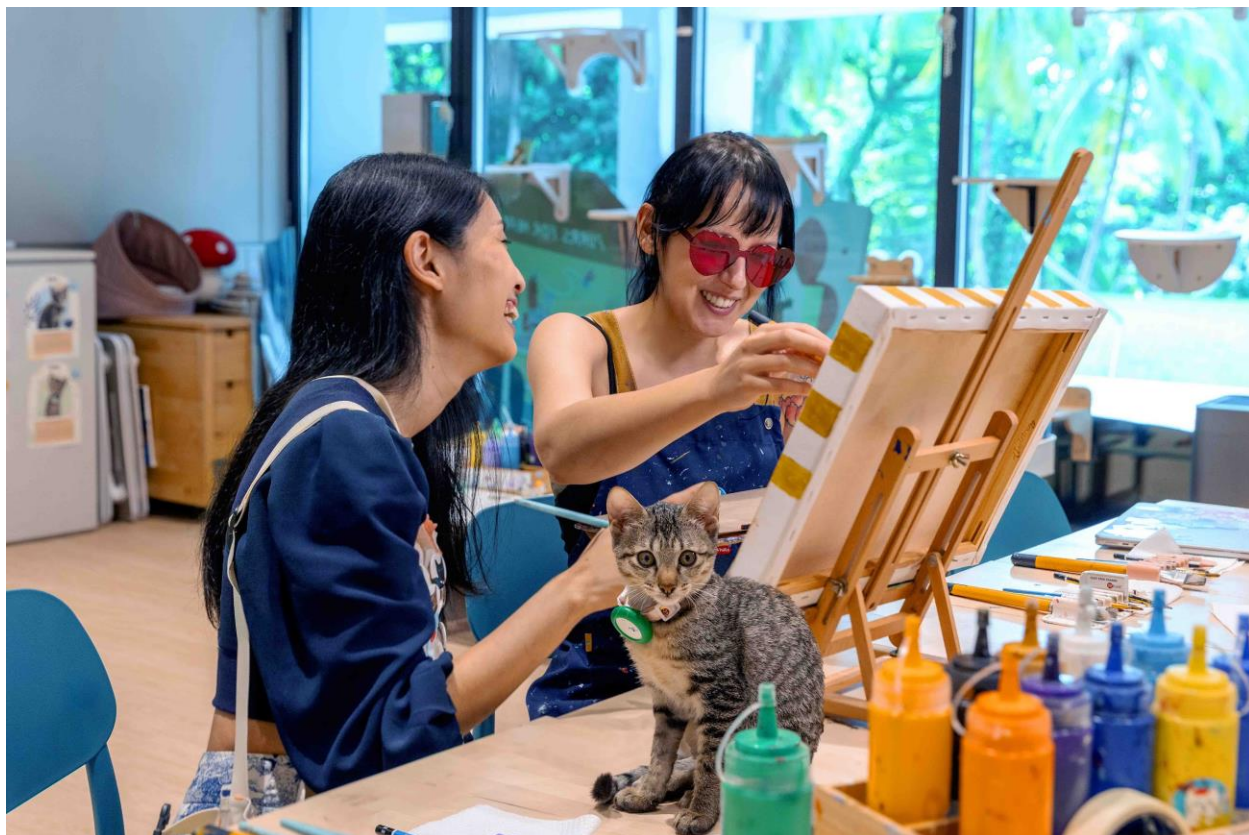
Image caption: Wildflower Studio , home to art and a community of rescue cats, offers a unique experience for art and cat lovers. Its 'Paint and Chill in Monochrome' programme uses monochromatic art therapy to help individuals process emotions, release feelings, and build coping strategies for stress and anxiety.