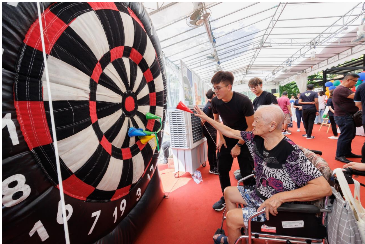
Image caption: The village hosted the first CaringSG CARECarnival in 2023 where caregivers learnt about resources for mental wellness, caring for their physical health and support groups/networks for caregivers.