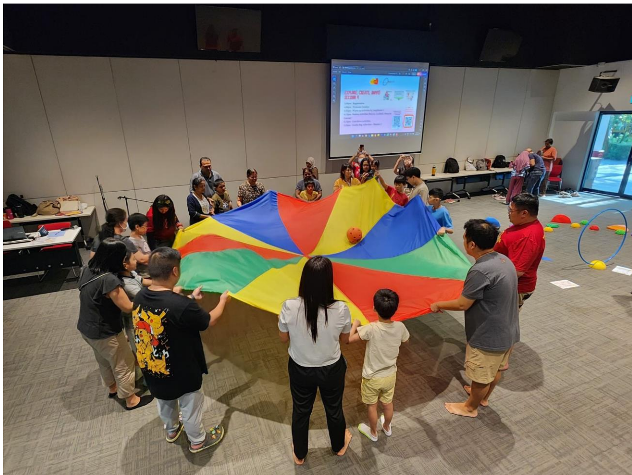
Image caption: Be Kind SG envisions a kind, inclusive society for all, focusing on persons with disabilities, including those with intellectual disabilities and autism. Through initiatives like Play.Able, it provides a safe, judgement-free space where children of all abilities can play, connect, and develop social skills.