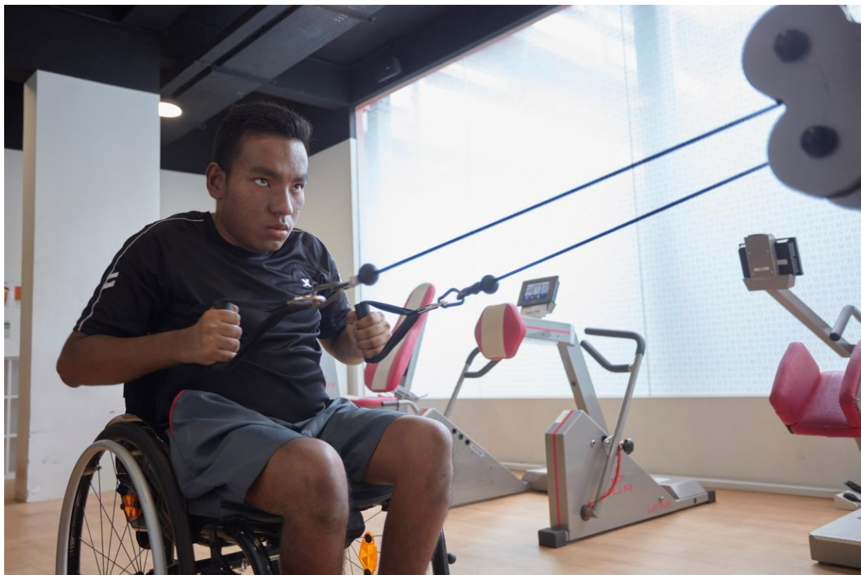
Image caption: Success at the Village paved the way for Sport Singapore to commit to making all ActiveSG gyms inclusive by 2026.