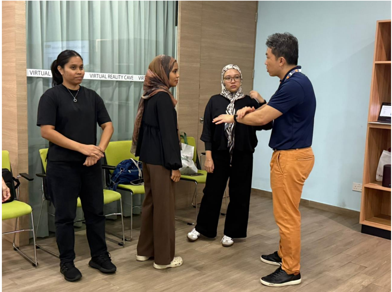
Image caption: Caregivers participated in the Importance of Caregiver Safety workshop by APSN Learning Hub at the Caregivers Pod, learning practical strategies to identify and manage meltdowns with confidence and care.