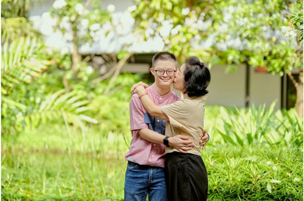
Image caption: The Take-A-Break (TAB) programme by SPD with support from SG Enable, provides escort services, personal care assistance, and social activities for persons with disabilities. These services give caregivers time to rest or attend to errands with peace of mind.