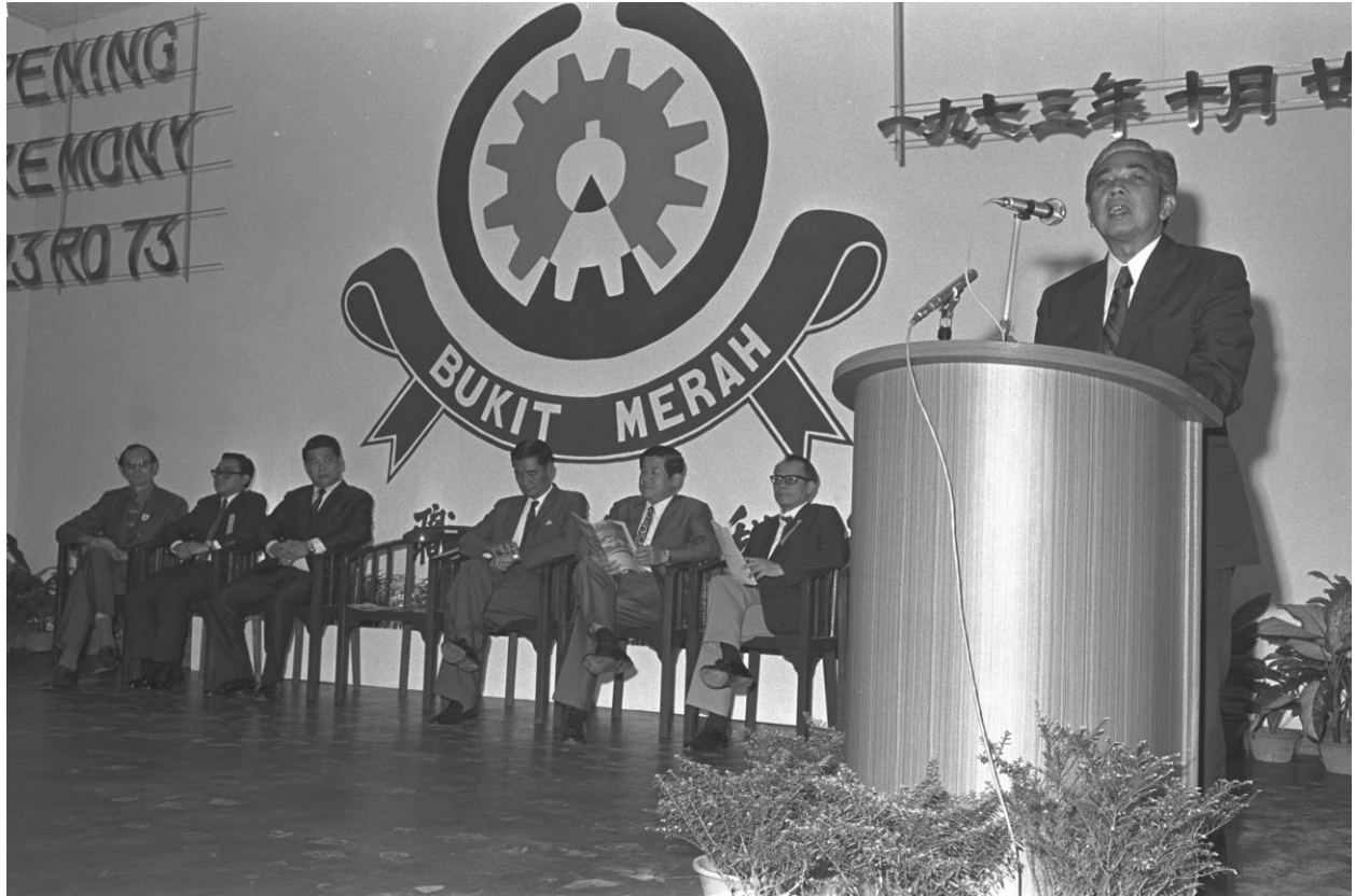
Image caption: Former site of Enabling Village: Bukit Merah Vocational Institute in 1973 to 2000s.