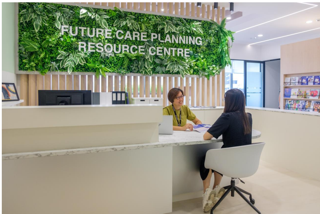
Image caption: The Future Care Planning Resource Centre strengthens sector capabilities and engages community partners to empower persons with disabilities and their caregivers to plan early and confidently for their long-term care.