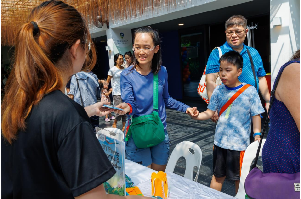
Image caption: The village hosted the first CaringSG CARECarnival in 2023 where caregivers learnt about resources for mental wellness, caring for their physical health and support groups/networks for caregivers.