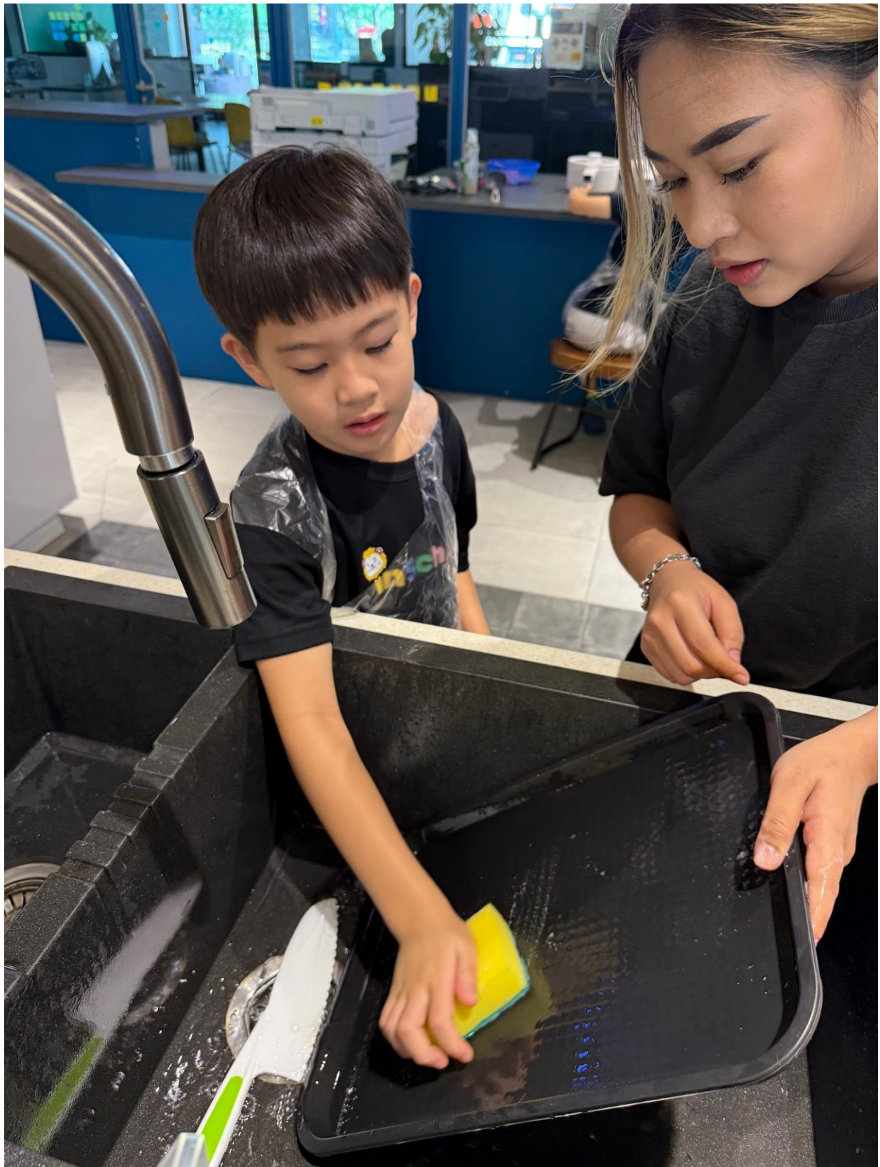
Image caption: InSchool equips neurodivergent children aged 7 to 12 with functional