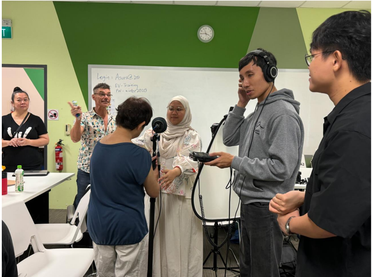
Image caption: Nanyang Technological University's Wee Kim Wee School of Communication and Information x SG Enable - an interactive filmmaking workshop where persons with disabilities worked with professional filmmakers to create short films.