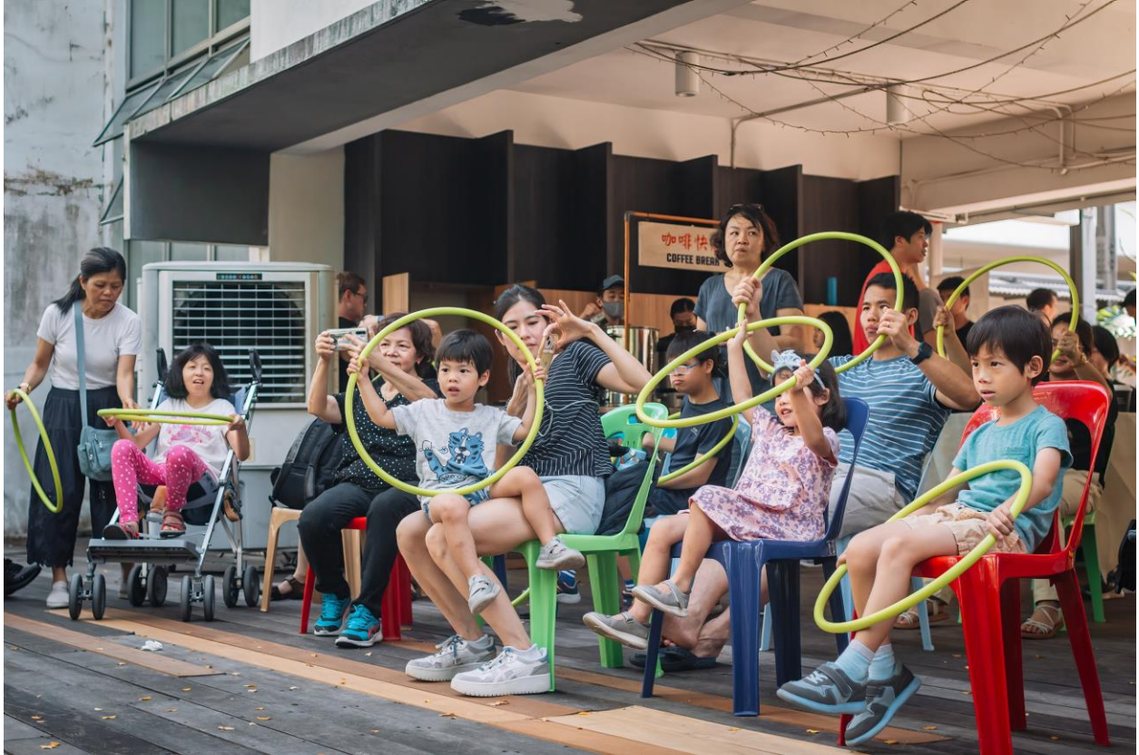
Image caption: Enabling Village curates a regular line-up of inclusive programmes that range from arts, culture, sports, education to innovation and technology. These programmes foster interaction and integration between persons with disabilities and the wider community, as well as promote greater awareness and positive mindsets about disability.