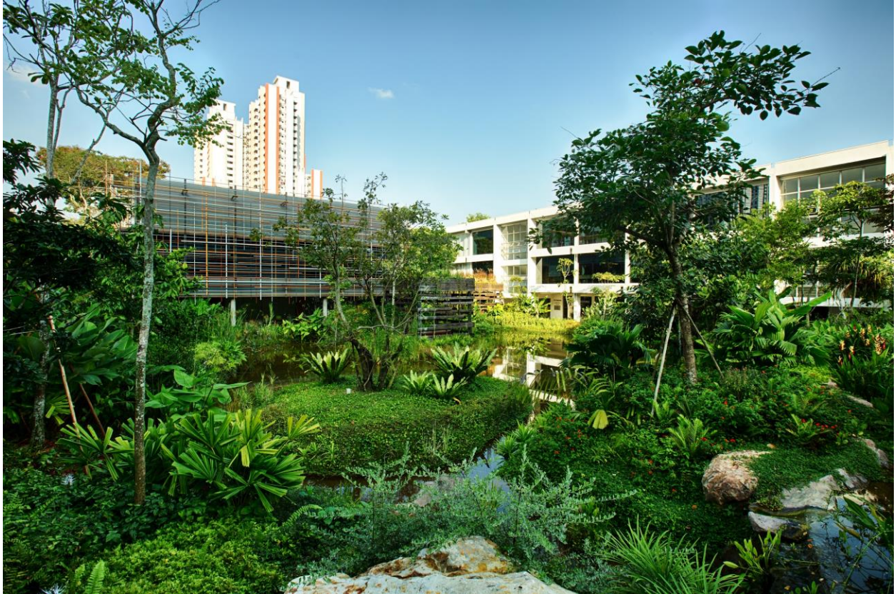
Image caption: Over 140 native and rare plant species attract wildlife including hornbills, kingfishers, butterflies, and damselflies.