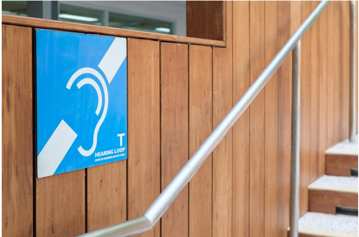
Image caption: A hearing loop system covers event spaces, transmitting audio directly to hearing aids.

Lush greenery becomes a green lung in the neighbourhood, providing a peaceful retreat and sensory-friendly space.