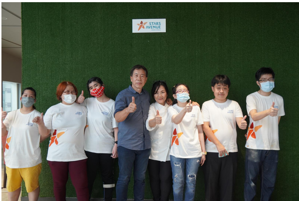
Image caption: EatTalk at Enabling Village is a training and deployment hub for persons with disabilities interested in the F&B sector. It also employs persons with disabilities alongside their caregivers, enabling shared on-the-job training and meaningful employment.