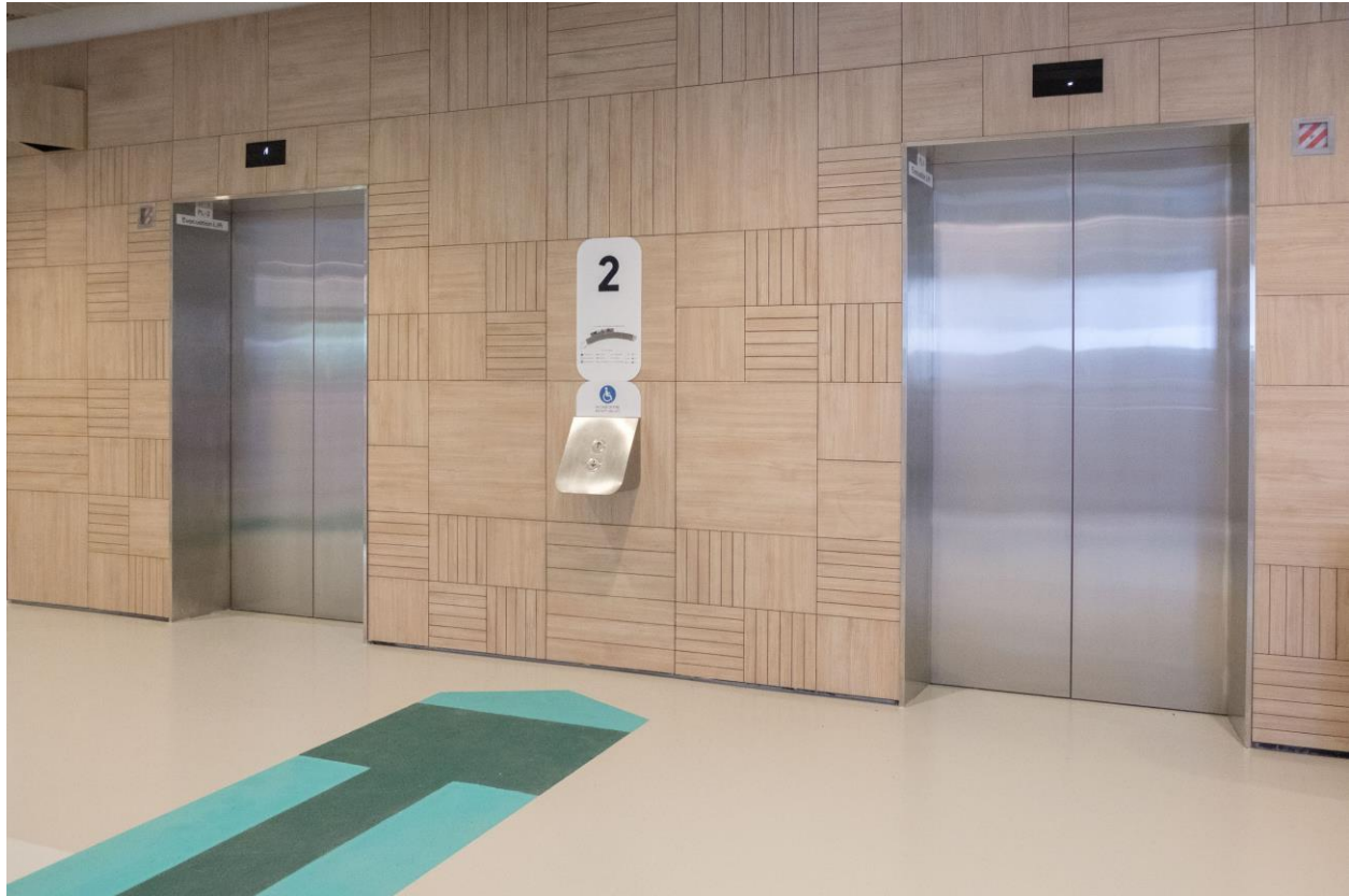
Image caption: With room for two wheelchairs, the lifts at Vista block enable visitors using mobility devices to move freely.

Image caption: Calm rooms incorporate soft furnishings and adjustable lighting for a supportive and comfortable setting for individuals experiencing sensory overload or sensitivity to their surroundings.