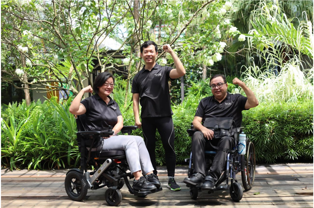
Image caption: 'This is my second home. It is where I have grown, found support, and connected with people who see me for who I am, not my disability. For many of us in the community, this place gives us courage to dream bigger. For Singapore, Enabling Village shows how we can build a society where everyone can belong.'

their pilot in the Village, and the programme has since expanded to offer accessible experiences at Sentosa and beyond.