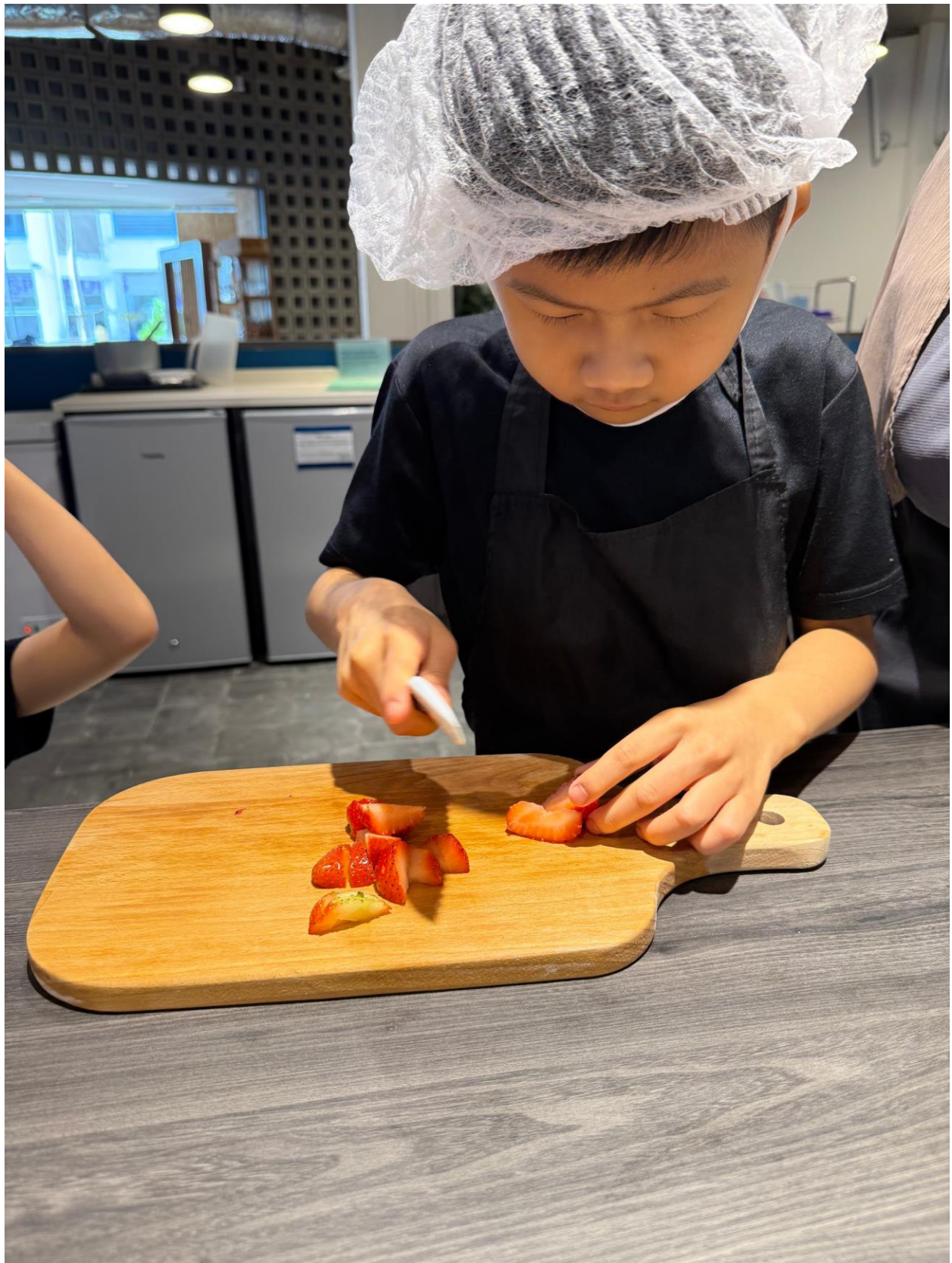
Image caption: InSchool equips neurodivergent children aged 7 to 12 with functional