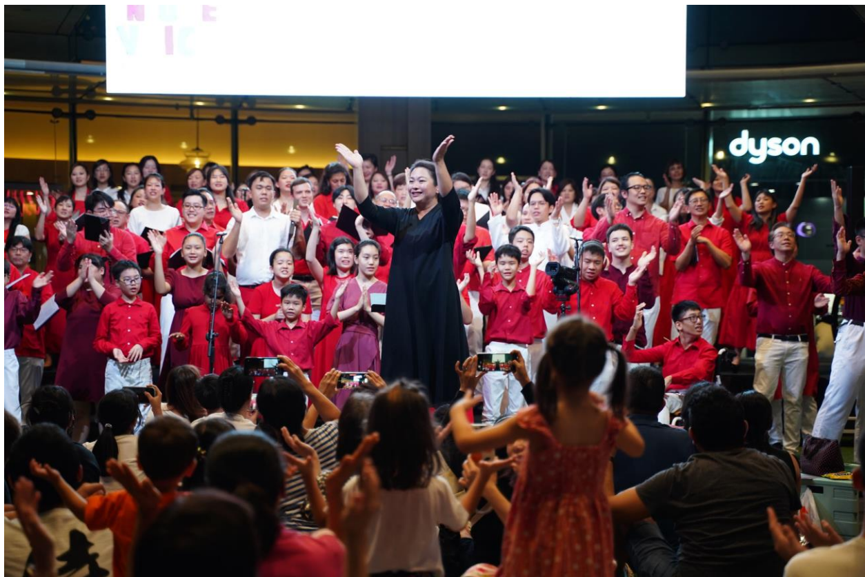
Image caption: Voices of Singapore , the nation's largest singing organisation with over 30 groups and almost 2,000 members, champions inclusivity through its community impact programmes, welcoming singers of all abilities and ages, from children with special needs to seniors, fostering a shared love of choral music.