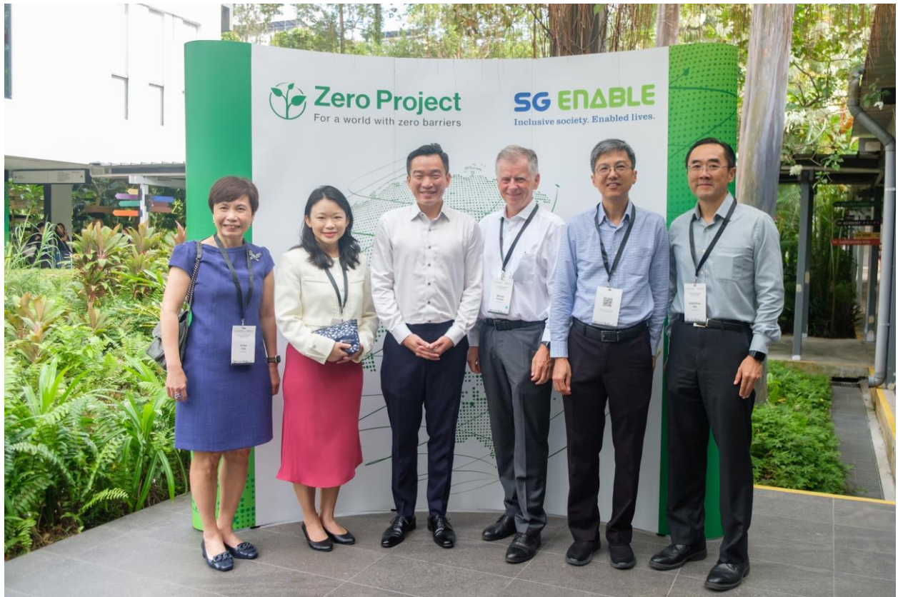
Image caption: Since 2023, SG Enable has partnered with the Austria-based non-profit initiative by the Essl Foundation, Zero Project, to share expertise and ideas through symposiums on social innovations that advance the United Nations Convention on the Rights of Persons with Disabilities