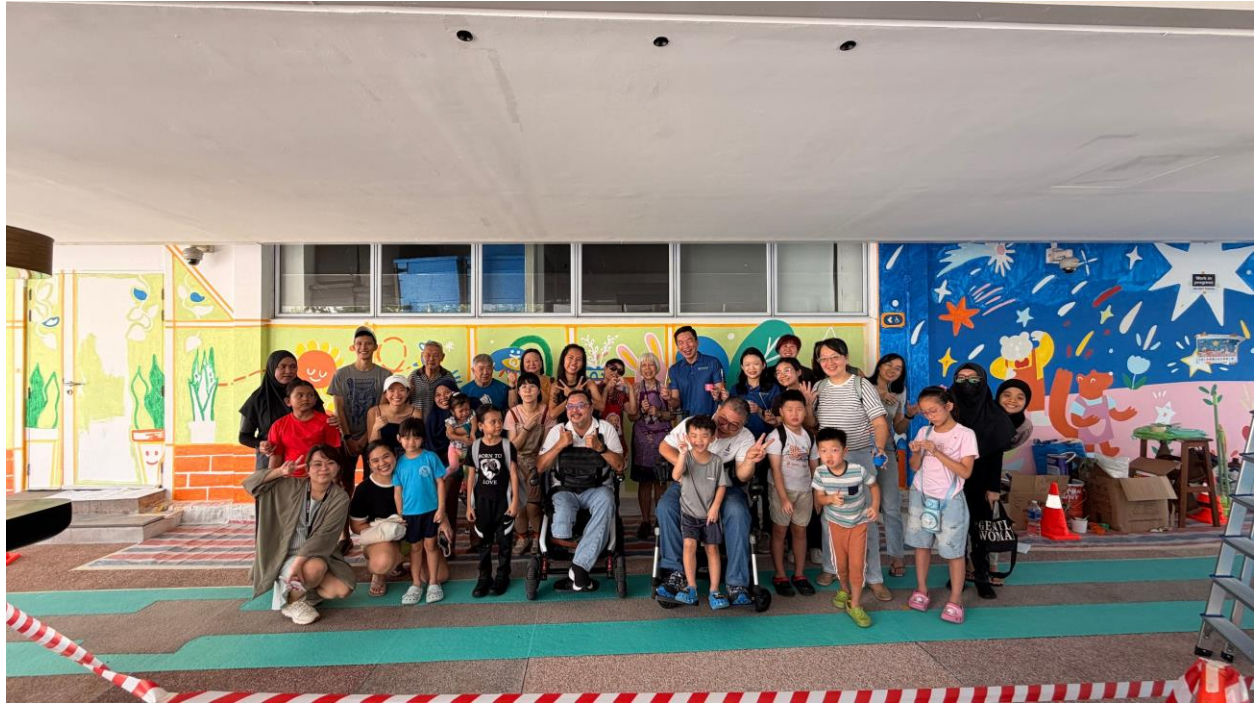
Image Caption: In commemoration of Enabling Village's 10th Anniversary and SG60, over 650 community stakeholders and disability sector members co-created a mural titled 'Garden of Possibilities', symbolising inclusion and the community's collective spirit.

650 community stakeholders and disability sector members co-created a mural titled 'Garden of Possibilities', symbolising inclusion and the community's collective spirit.