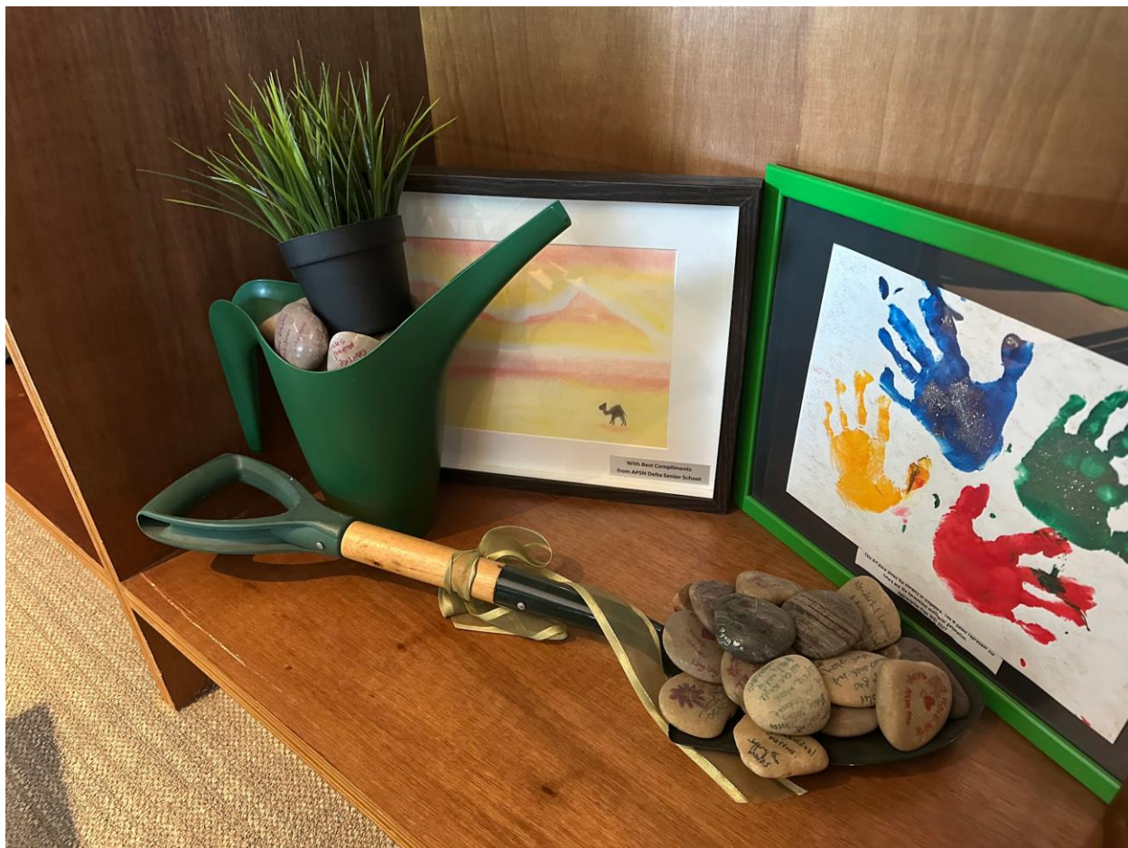
Image caption: Shovel used at the Groundbreaking Ceremony. Pebbles containing well-wishes from the community and sector partners.

Opening of Enabling Village by then-Prime Minister Lee Hsien Loong on 2 December 2015 as Singapore's first inclusive community space, with a focus on training and employment of persons with disabilities.