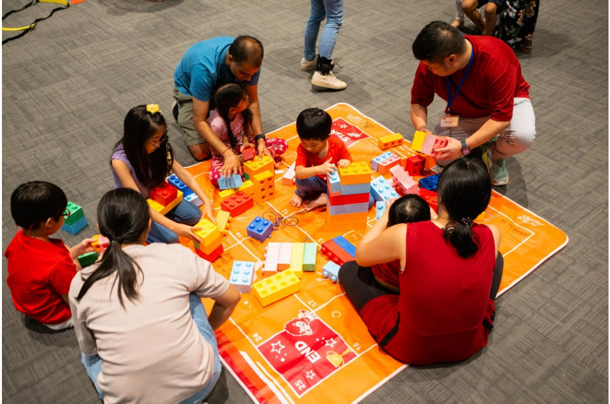
Image caption: Be Kind SG envisions a kind, inclusive society for all, focusing on persons with disabilities, including those with intellectual disabilities and autism. Through initiatives like Play.Able, it provides a safe, judgement-free space where children of all abilities can play, connect, and develop social skills.