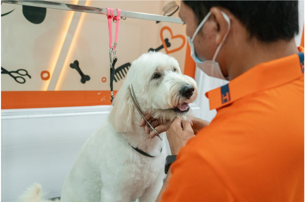
Image caption: Beyond a pet café, Bailey and Patch offers training for persons with disabilities in basic pet grooming, mainly washing, drying and combing.

Image caption: Inclus also conducts mock interview sessions for persons with disabilities to help them prepare for real interviews and build confidence and communication skills.