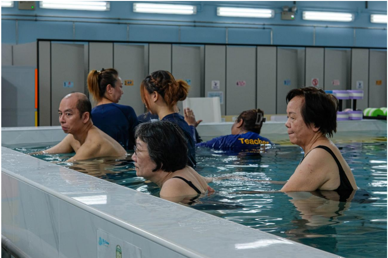
Image caption: S3 members attending aqua therapy classes at Little Splashes.

With curated inclusive offerings for persons with disabilities and the wider community, the Village offers a vibrant space to connect, learn, and grow. Through arts, sports, music, and everyday interactions, it demonstrates how inclusive design fosters participation and builds stronger communities.