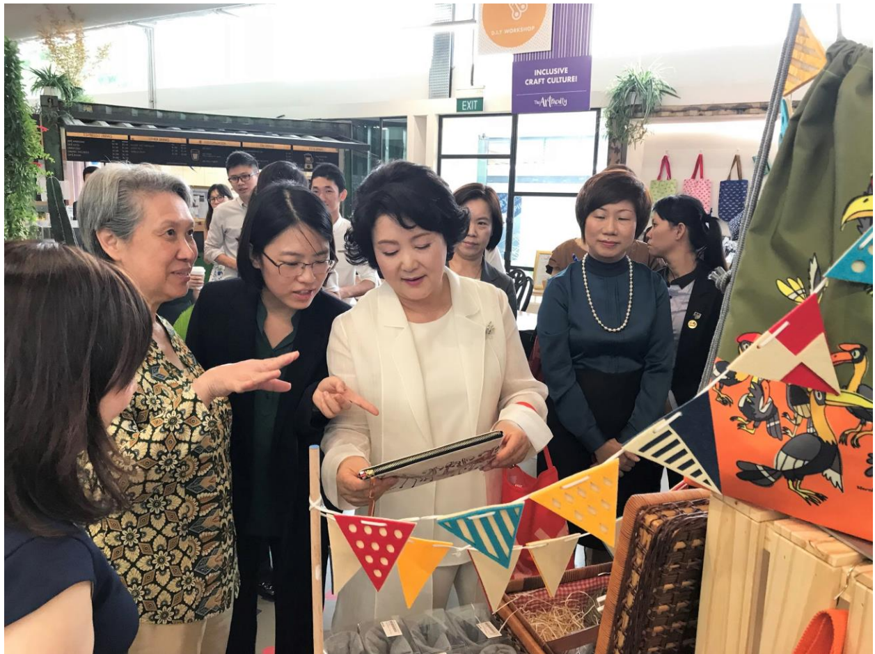
Image caption: Mdm Ho Ching, wife of then-Singapore's Prime Minister, hosted Mdm Kim Jung-Sook, then First Lady of the Republic of Korea, at Enabling Village. She learned about the various facilities and visited The Art Faculty.