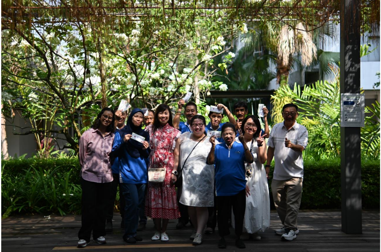
Image caption: Celebrating the service staff who keep the Village clean, welcoming and full of heart.