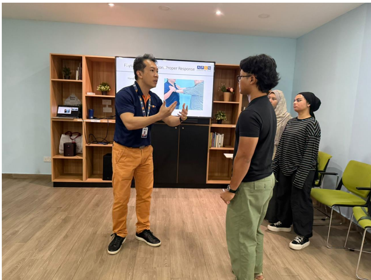
Image caption: Caregivers participated in the Importance of Caregiver Safety workshop by APSN Learning Hub at the Caregivers Pod, learning practical strategies to identify and manage meltdowns with confidence and care.