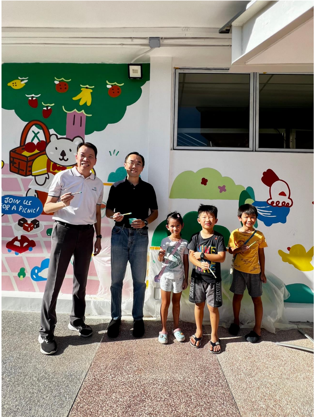
Image Caption: In commemoration of Enabling Village's 10th Anniversary and SG60, over