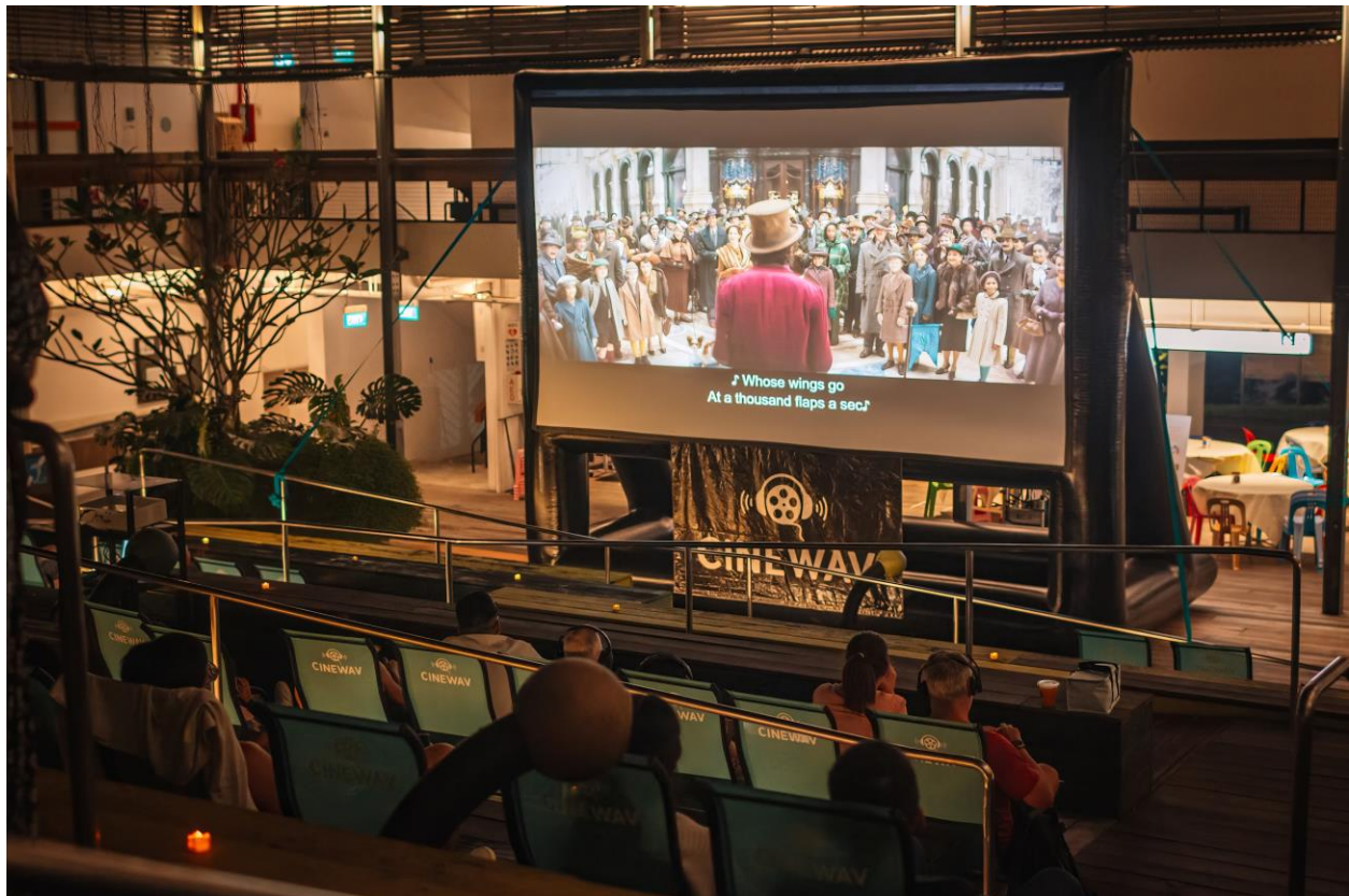
Image caption: Movies Under The Stars by Cinewav - an outdoor movie night where audiences can unwind and enjoy films under the open sky.