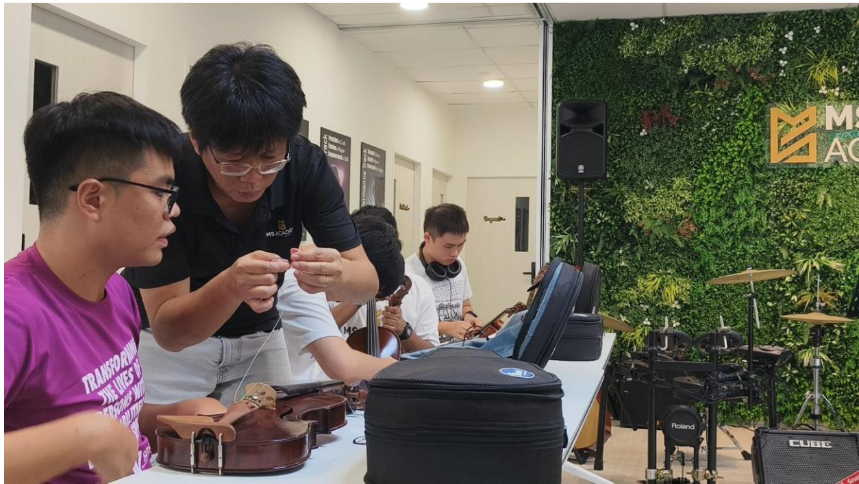
Image caption: MS Academy provides training for persons with disabilities in music instrument repairs, creative arts, workplace readiness, and work attachments with partner organisations.