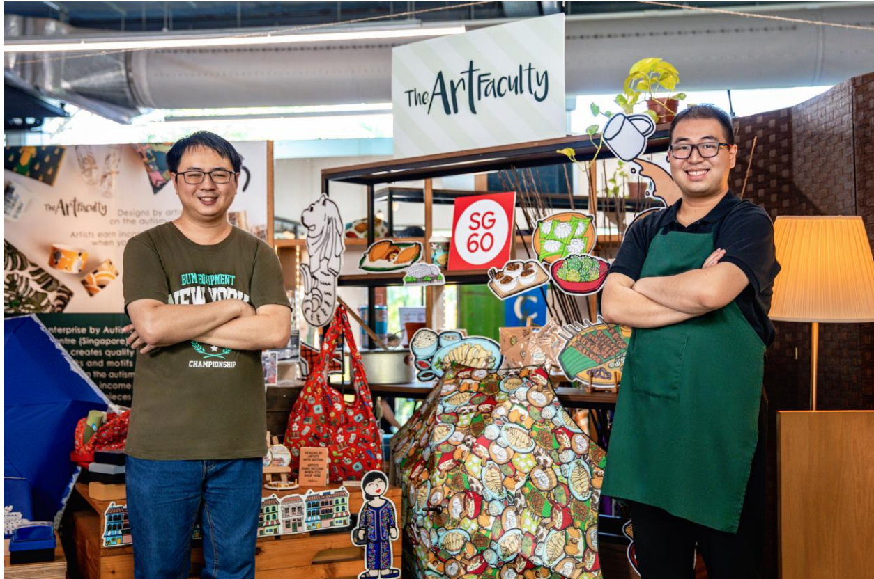
Image caption: The Art Faculty, ARC's social enterprise, empowers artists on the autism spectrum through showcasing and the sale of their artworks embellished onto merchandise.

i'mable Collective Space supports inclusive employment in the design and arts sectors by providing a platform for pan-disability creatives to showcase their talents.