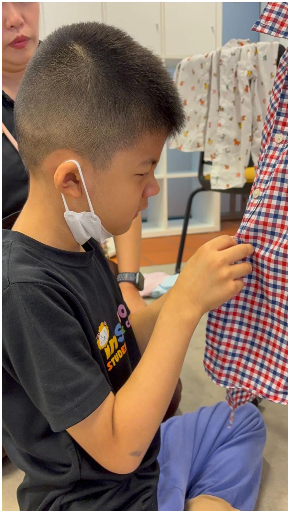
Image caption: InSchool equips neurodivergent children aged 7 to 12 with functional