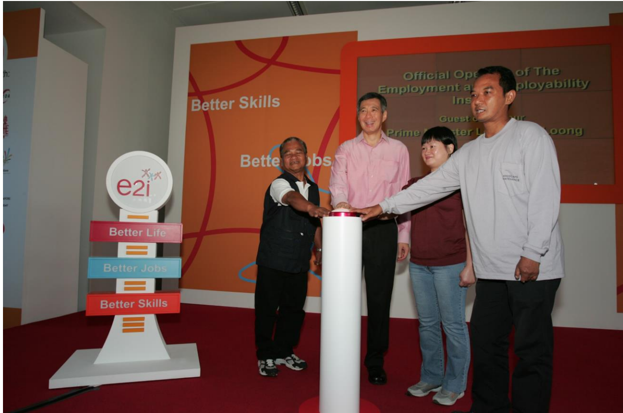
Image caption: Former site of Enabling Village: Employment and Employability Institute (e2i), 2008 to 2014.