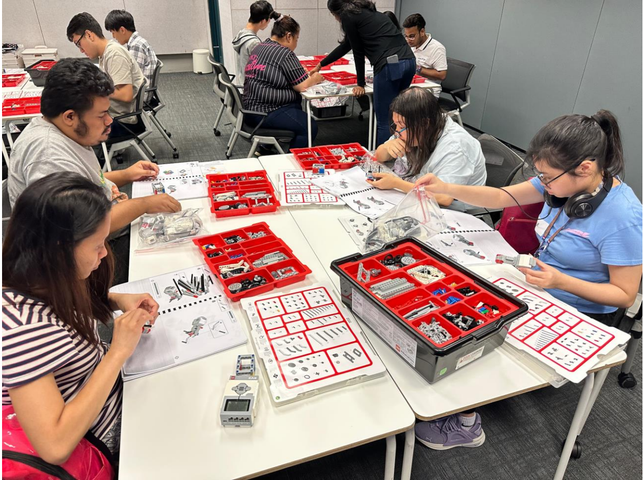
Image caption: Inclus provides enrichment activities like piecing together LEGO Mindstorms, which requires participants to remain focused and follow instructions and troubleshoot.