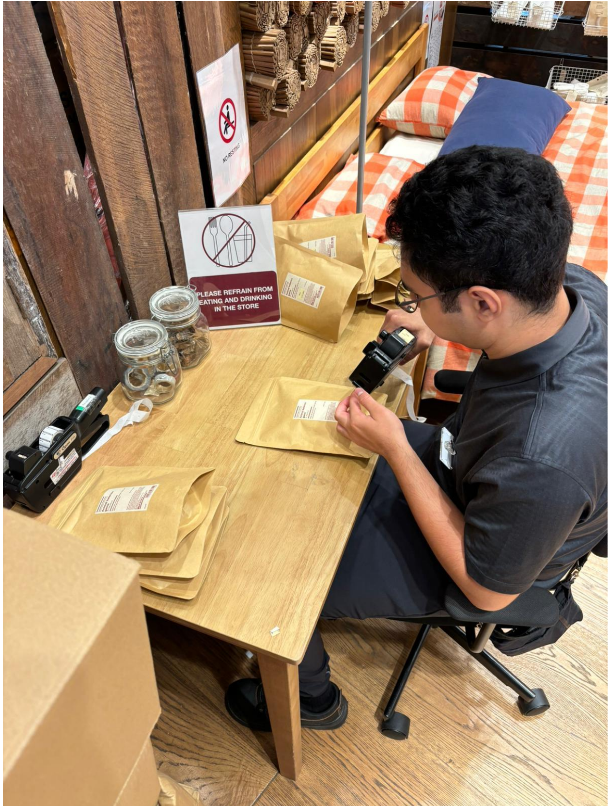
Image caption: School-to-Work trainees are placed in group internships or open