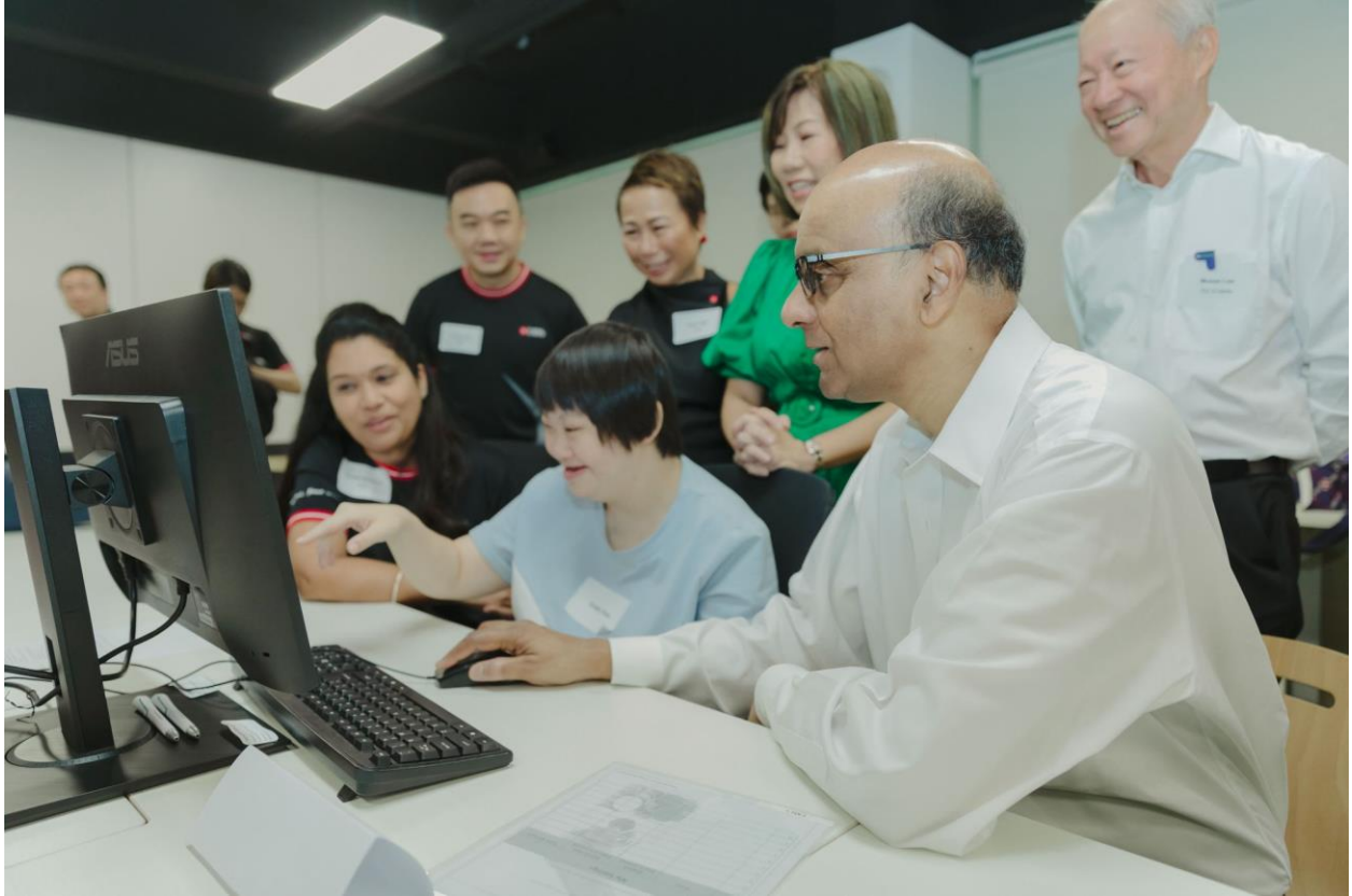
Image caption: Partnership between DBS Foundation and SG Enable to equip persons with disabilities and caregivers with financial and digital literacy skills. President Tharman Shanmugaratnam observes and tests a training programme delivered with DBS volunteers.

Empowering persons with disabilities with independent living skills