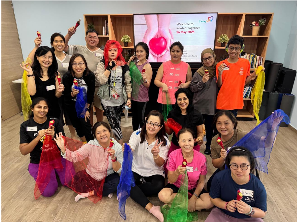
Image caption: CaringSG's R.E.S. Studios (Resilience, Empowerment, and Sanctuary) provide emotional support, skills training and respite for caregivers. Together, these studios create a holistic support for the entire family, ensuring that no caregiver walks alone.