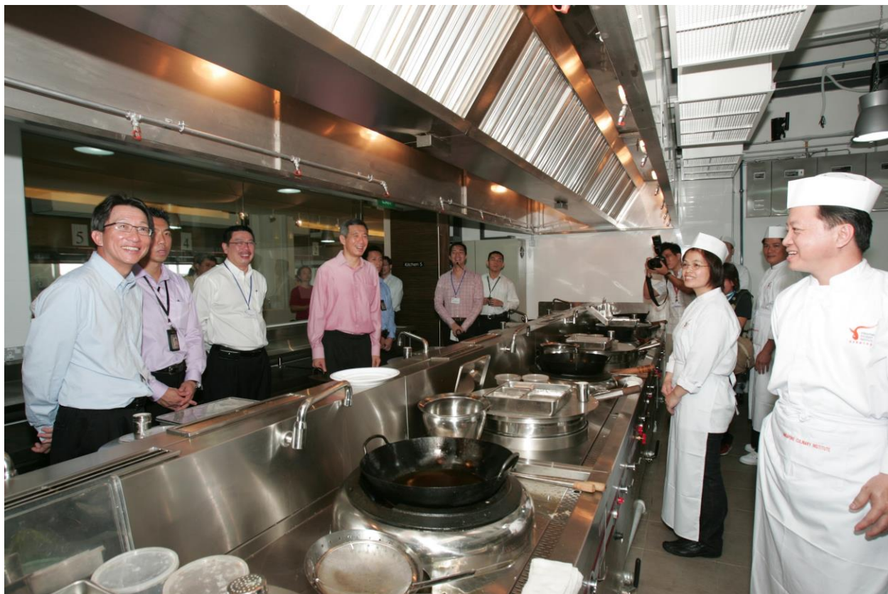
Image caption: Former site of Enabling Village: Employment and Employability Institute (e2i), 2008 to 2014.