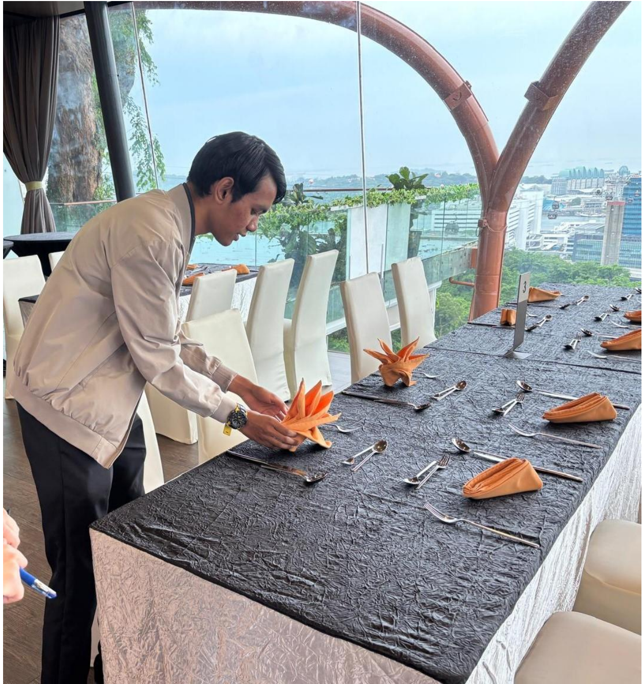
Image caption: School-to-Work trainees are placed in group internships or open employment with job coaching support in various roles.

employment with job coaching support in various roles.