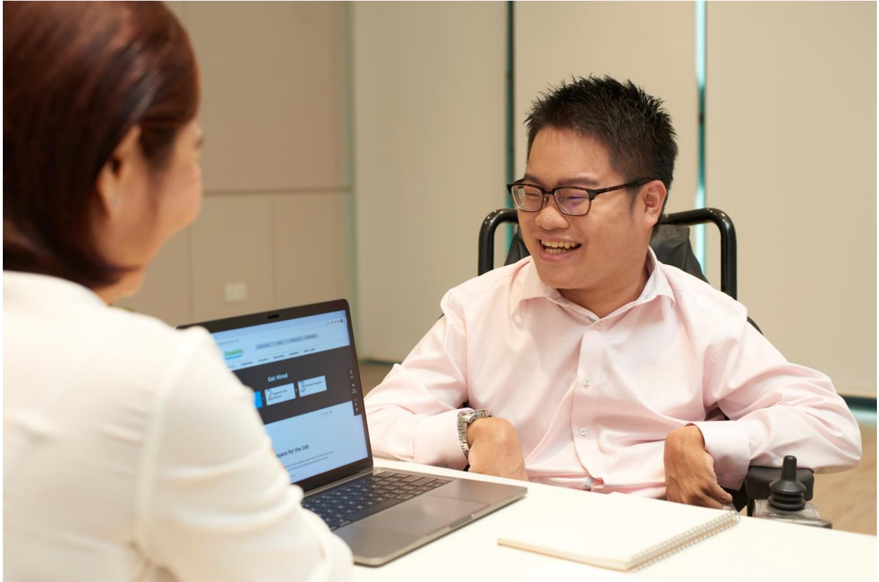
Image caption: Enabling Academy , Singapore's disability learning hub, partners with training providers and social service agencies to offer lifelong and vocational training for persons with disabilities, while equipping employers, co-workers, and caregivers with resources to support inclusive workplaces and independent living. It also promotes accessibility practices to ensure learning opportunities are open and inclusive to all.

Title: Learning for Life: Building Capabilities of Persons with Disabilities, Caregivers, and Employers through the Enabling Academy