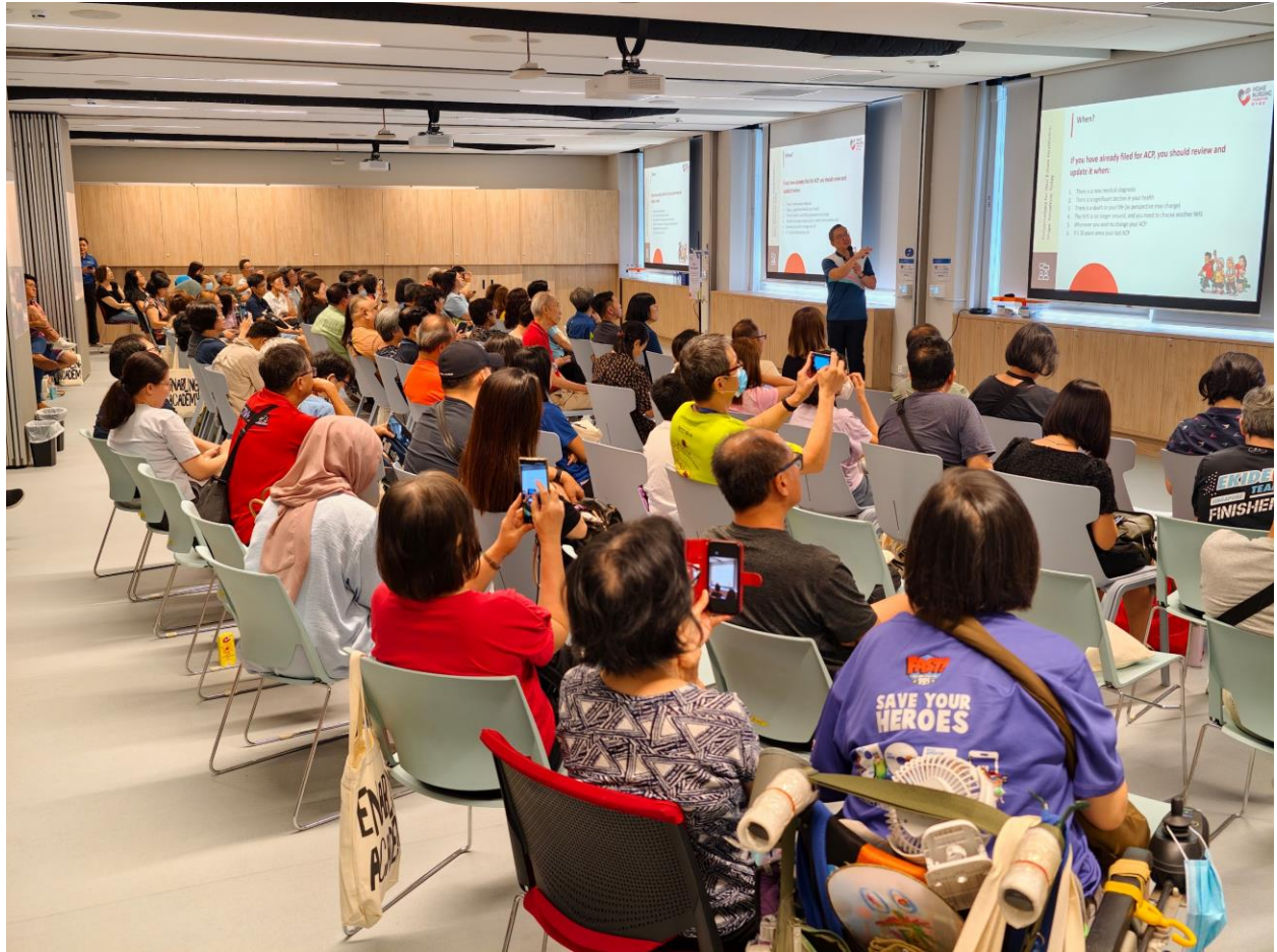
Image caption: Discussion on future planning with specialist speakers from CPF Board, Pro Bono SG, and Home Nursing Foundation. Part of Enabling Academy's Money Matters series, it empowers caregivers to plan for their loved ones' long-term needs.