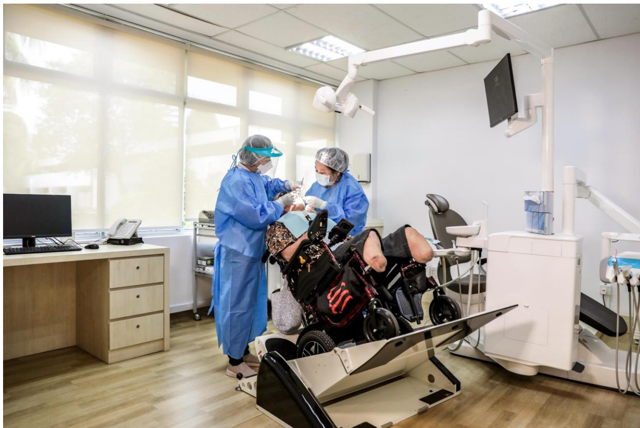
Image caption: Mount Alvernia Outreach Medical & Dental Clinics is equipped with a wheelchair tilter and its staff are trained in supporting persons with special needs.