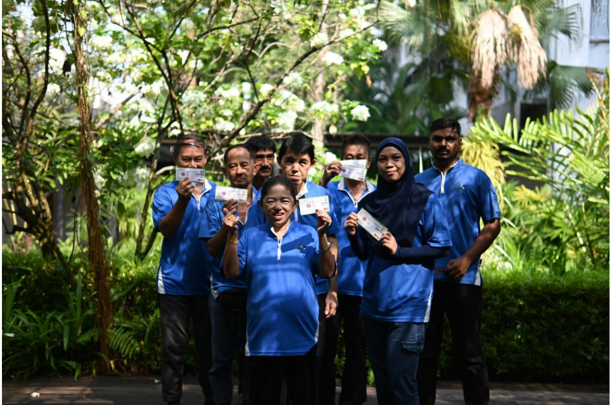
Image caption: Celebrating the service staff who keep the Village clean, welcoming and full of heart.