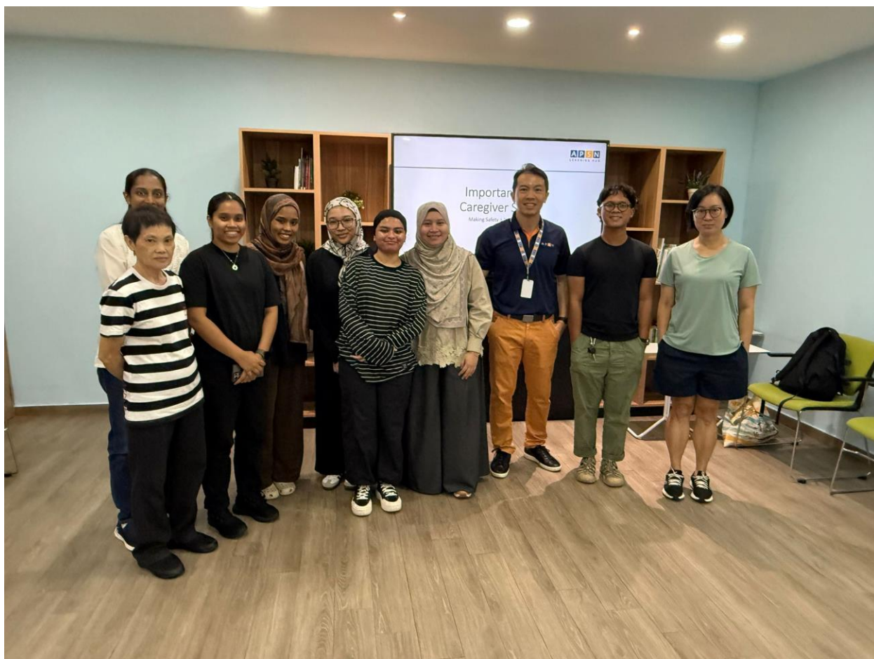
Image caption: Caregivers participated in the Importance of Caregiver Safety workshop by APSN Learning Hub at the Caregivers Pod, learning practical strategies to identify and manage meltdowns with confidence and care.