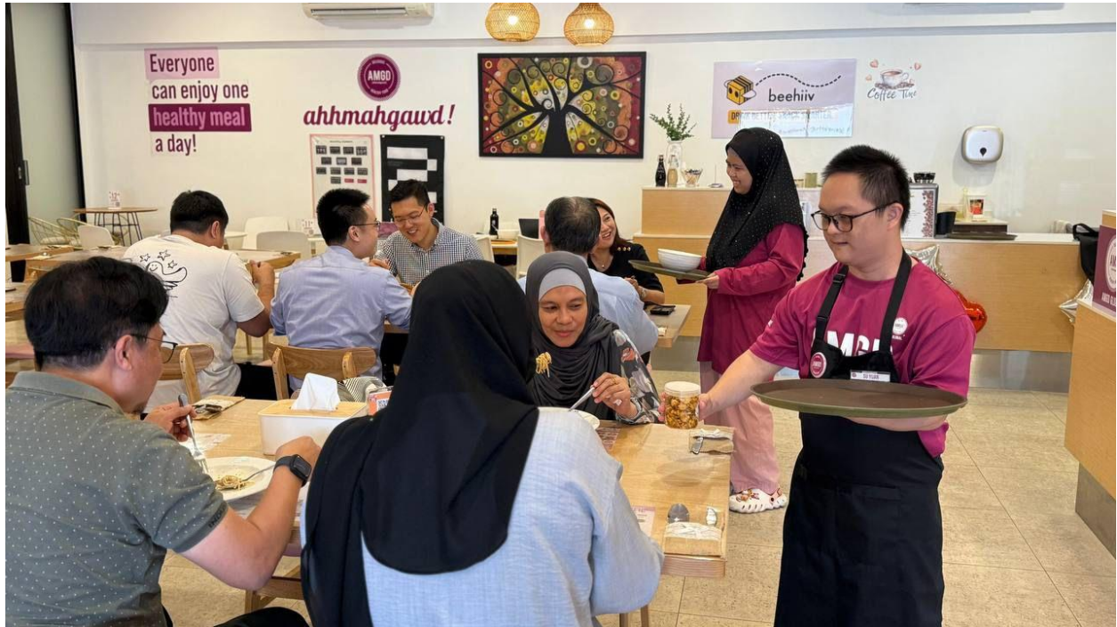
Image caption: AMGD Superfood Restaurant , Singapore's first halal, healthy, and inclusive superfood restaurant, serves nutritionist-designed, zero-waste meals that create employment for persons with disabilities and underserved communities.

living skills through personalised, hands-on learning that builds confidence, independence, and daily routines.