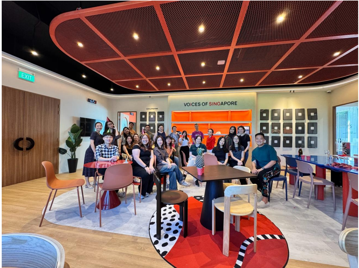
Image caption: Voices of Singapore , the nation's largest singing organisation with over 30 groups and almost 2,000 members, champions inclusivity through its community impact programmes, welcoming singers of all abilities and ages, from children with special needs to seniors, fostering a shared love of choral music.