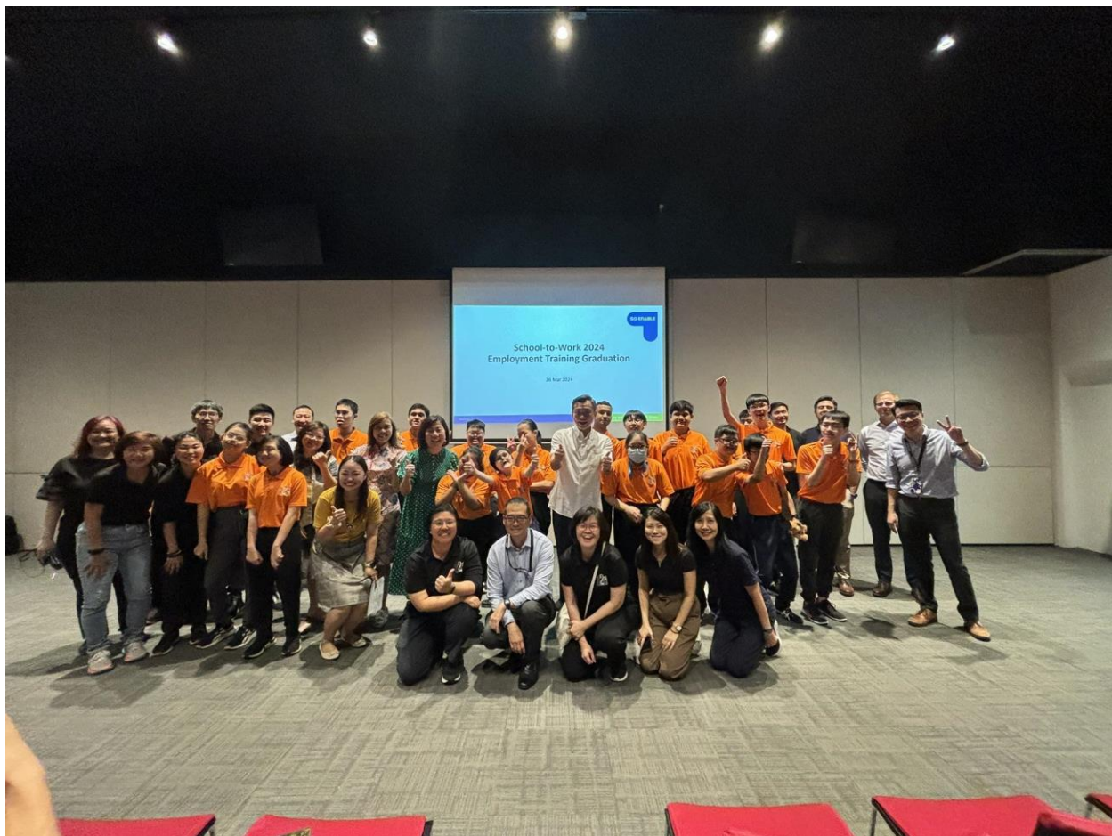
Image caption: Special education school graduands of the School-to-Work Transition Programme.