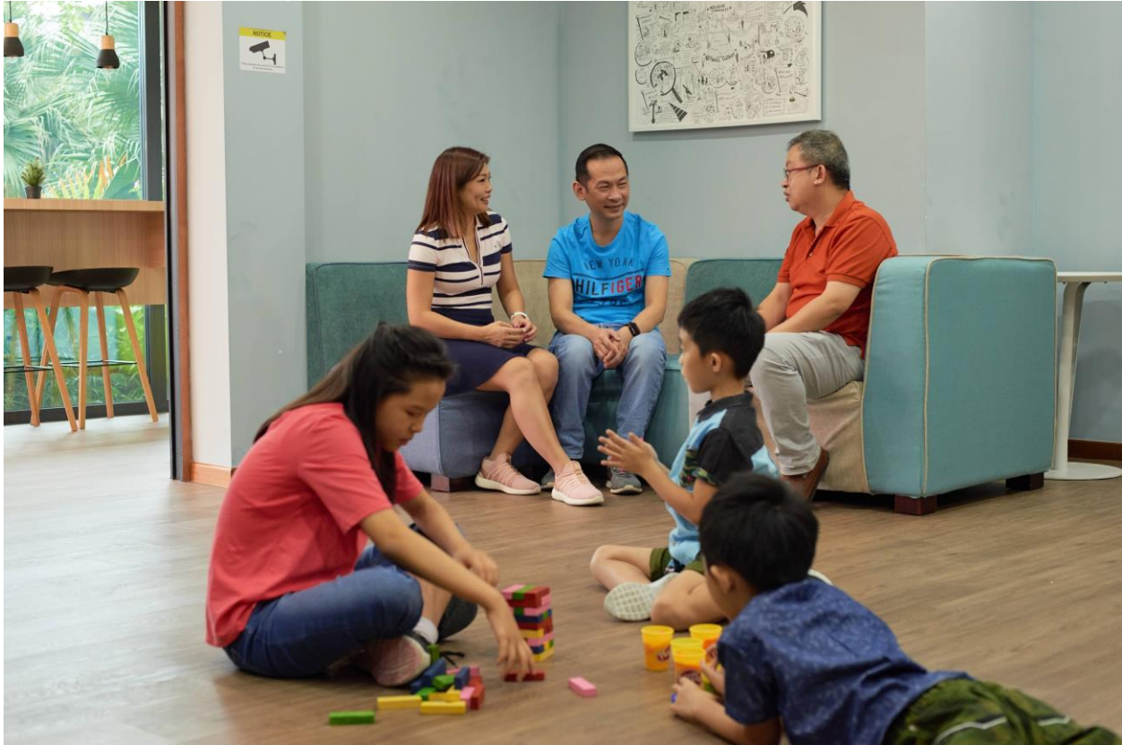
Image caption: The Caregivers Pod is a versatile space for caregiver support and gatherings, open to all seeking a welcoming place to connect.