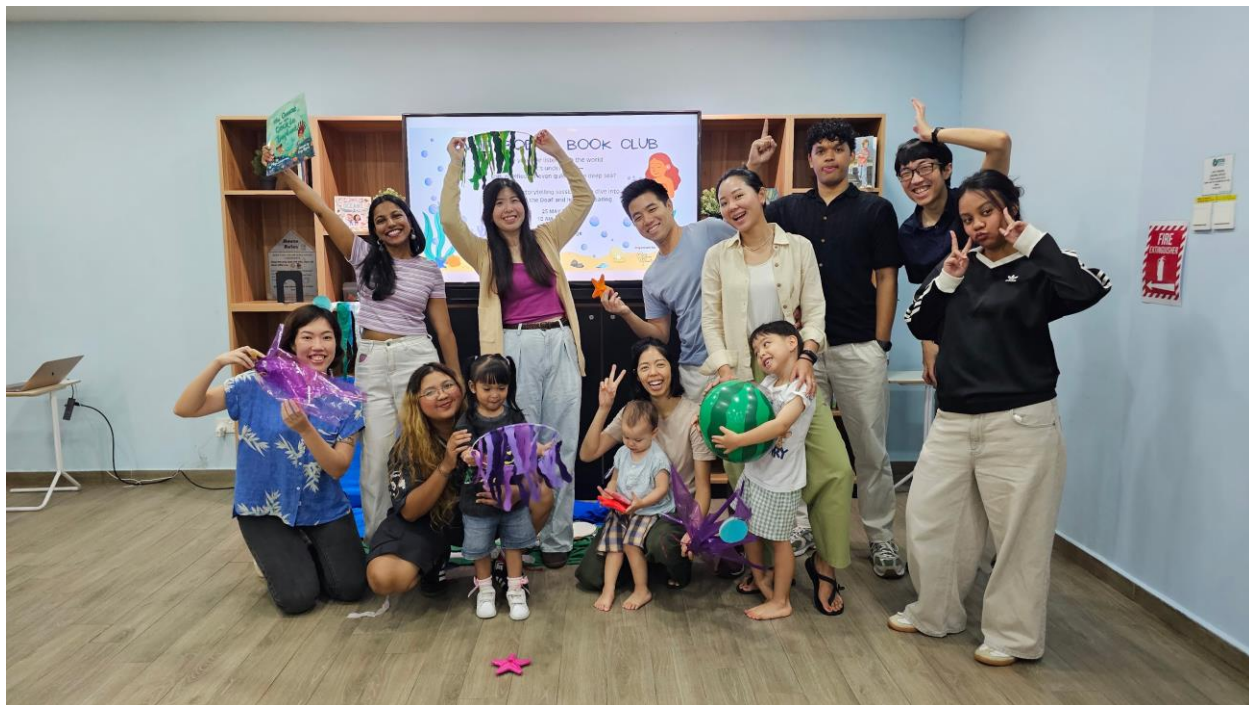
Image caption: 'Everybody's Book Club by Shoes Theatre Collective' - a fun and interactive storytelling session where participants explore different types of vision loss, discover Braille, and learn how people navigate the world through touch, sound, and imagination.