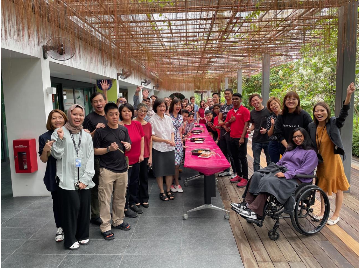
Image caption: Celebrating partnership and community at Enabling Village Tenant Get-Together sessions.