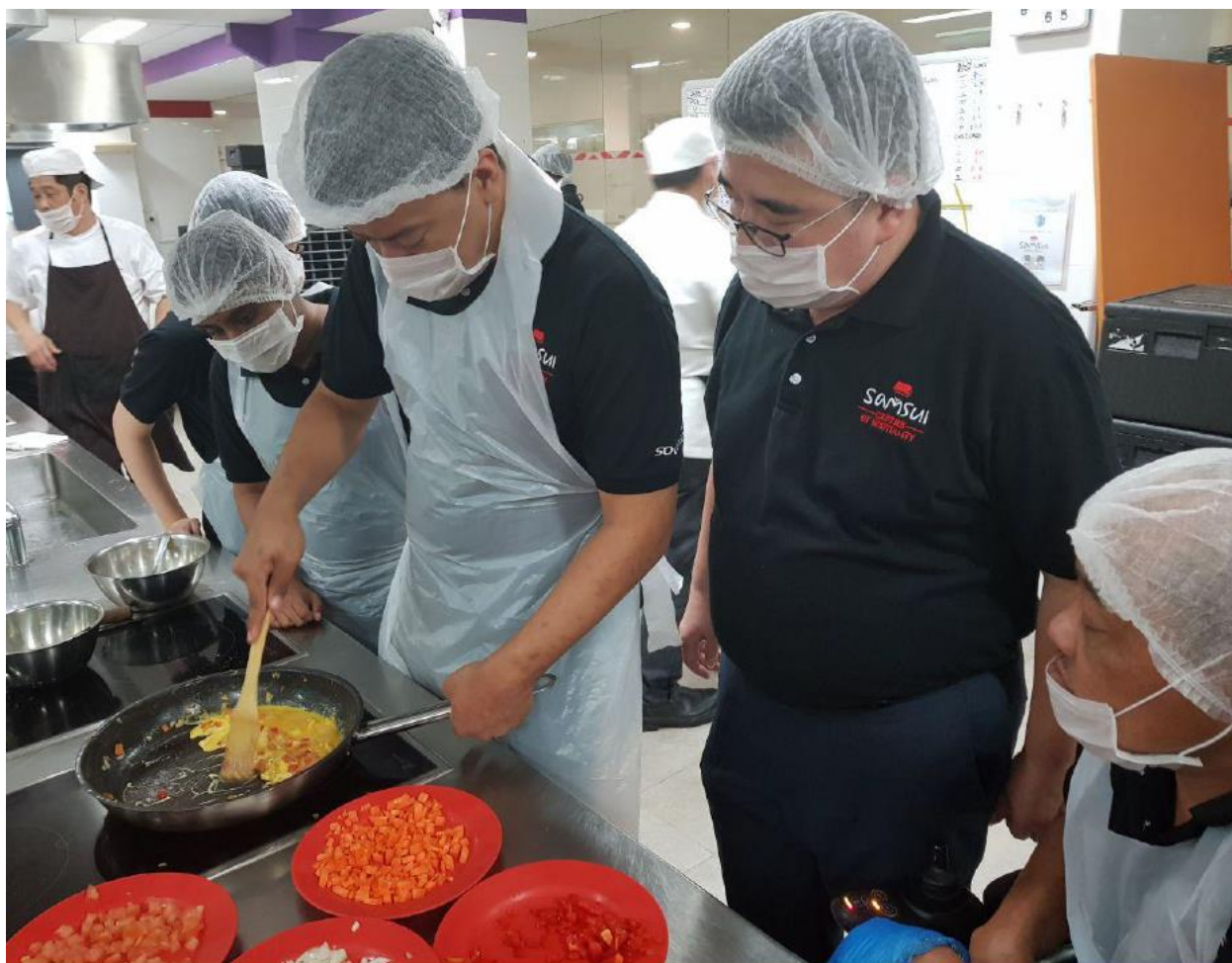
Image caption: Samsui Kitchen's vocational training guides trainees from classroom lessons in food prep and customer service, to hands-on kitchen practice, and finally to job placements in hotels, restaurants, and commercial kitchens.

The School-to-Work (S2W) Transition Programme is a multi-agency initiative by the Ministry of Education, Ministry of Social and Family Development, and SG Enable, in partnership with special education schools to transit graduates into employment.