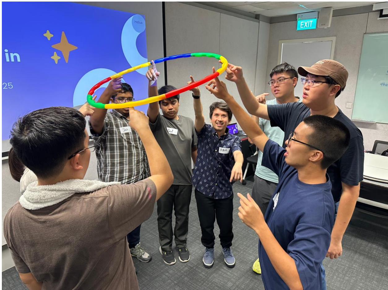
Image caption: Inclus' team-building activity where the participants need to communicate with one another to lower the hula hoop to the ground using only their index fingers, which allows them to develop clear communication skills.