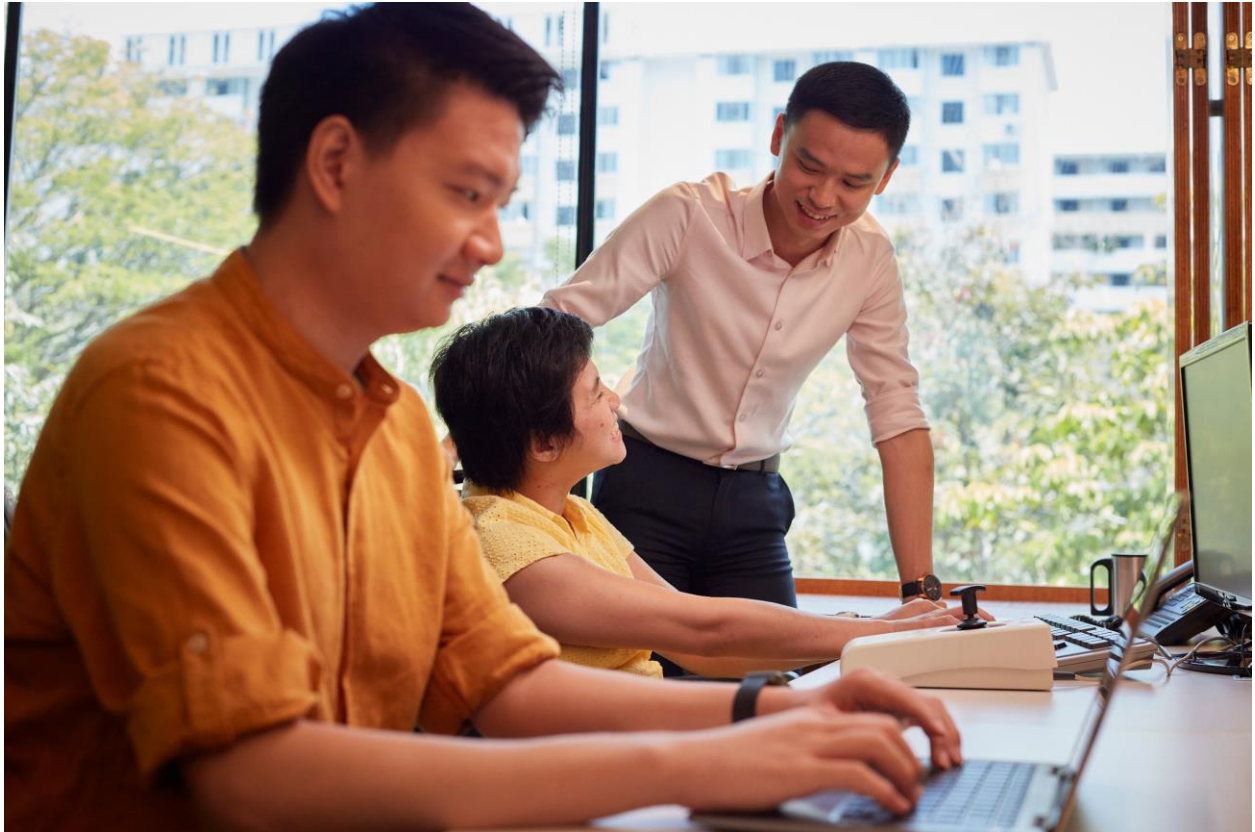
Image caption: Persons with disabilities receive job placement and job support through our partners like APSN, Autism Resource Centre (Singapore), MINDS and SPD.

The Employability & Employment Centre (E2C) by Autism Resource Centre (Singapore) (ARC) enhances the employability of individuals on the autism spectrum through training, job matching, and job support. It partners employers to create meaningful, structured roles and showcases inclusive employment practices.