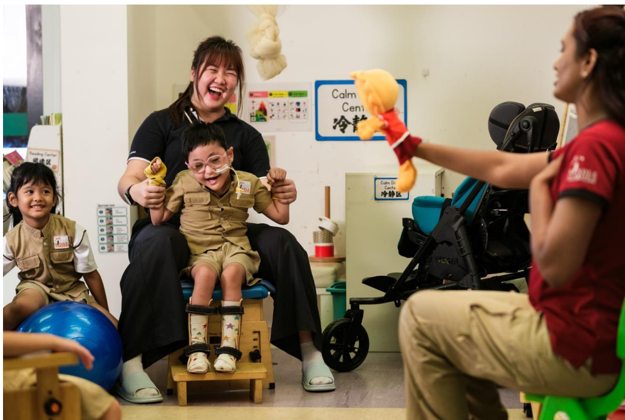
Image Caption: In 2016, with support from Lien Foundation, Kindle Garden by AWWA opened as Singapore's first inclusive preschool. The vision was clear: create a space where children of all abilities could grow and thrive.

Kindle Garden's approach is both intentional and innovative. With low teacher-to-child ratios and small class sizes, educators provide personalised attention while designing lessons that incorporate peer learning and cooperative play. Teachers work closely with AWWA's allied health professionals and early intervention specialists, creating individualised learning plans that unlock each child's potential, underpinned by a robust and well-rounded pedagogy.