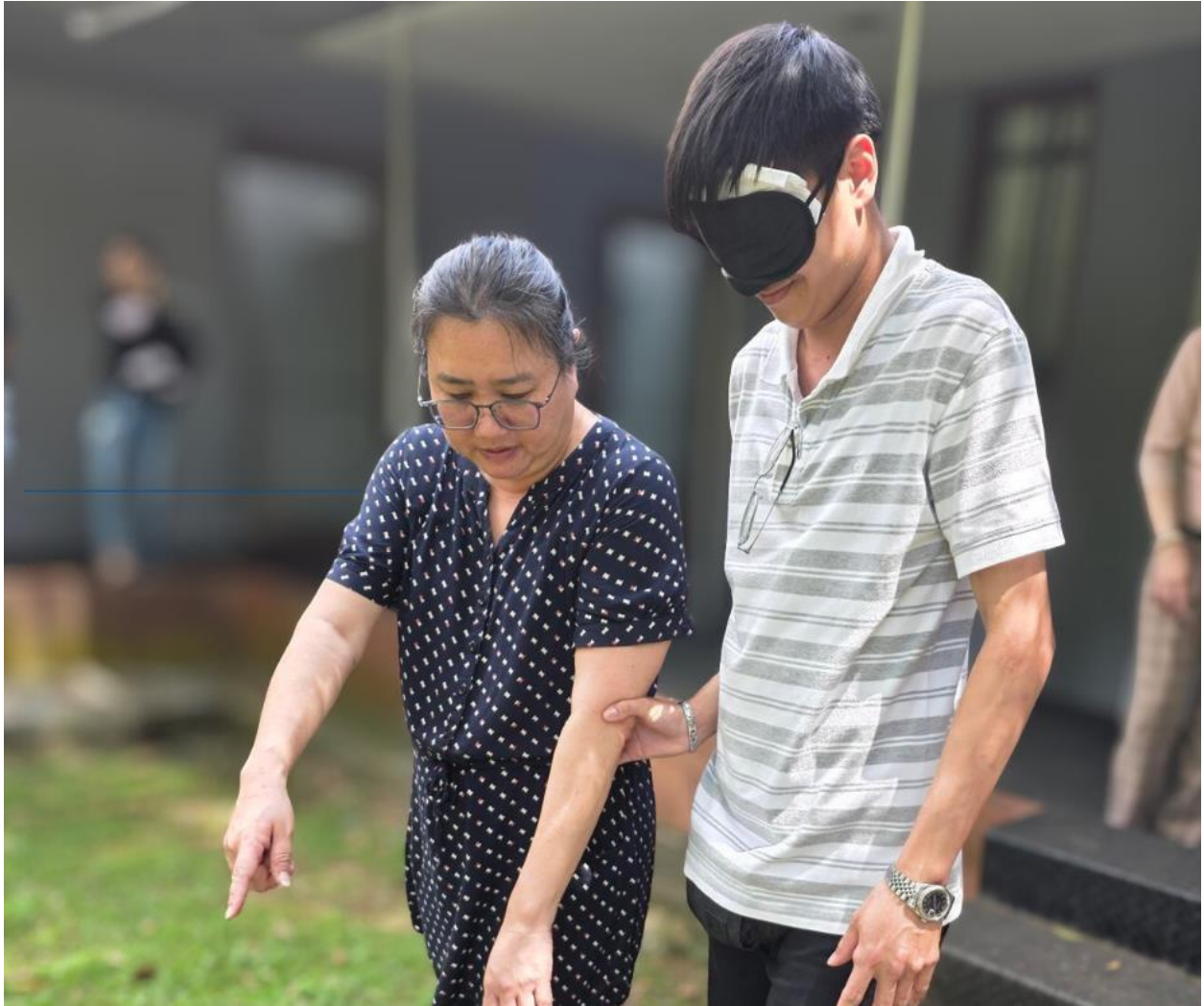
Image caption: Developed in collaboration with The Ascott Limited, the 'Disability Inclusion for Hospitality Professionals' programme offers hands-on experience for learners to create an inclusive experience for all. The course is available to the public at Ascott Centre for Excellence.