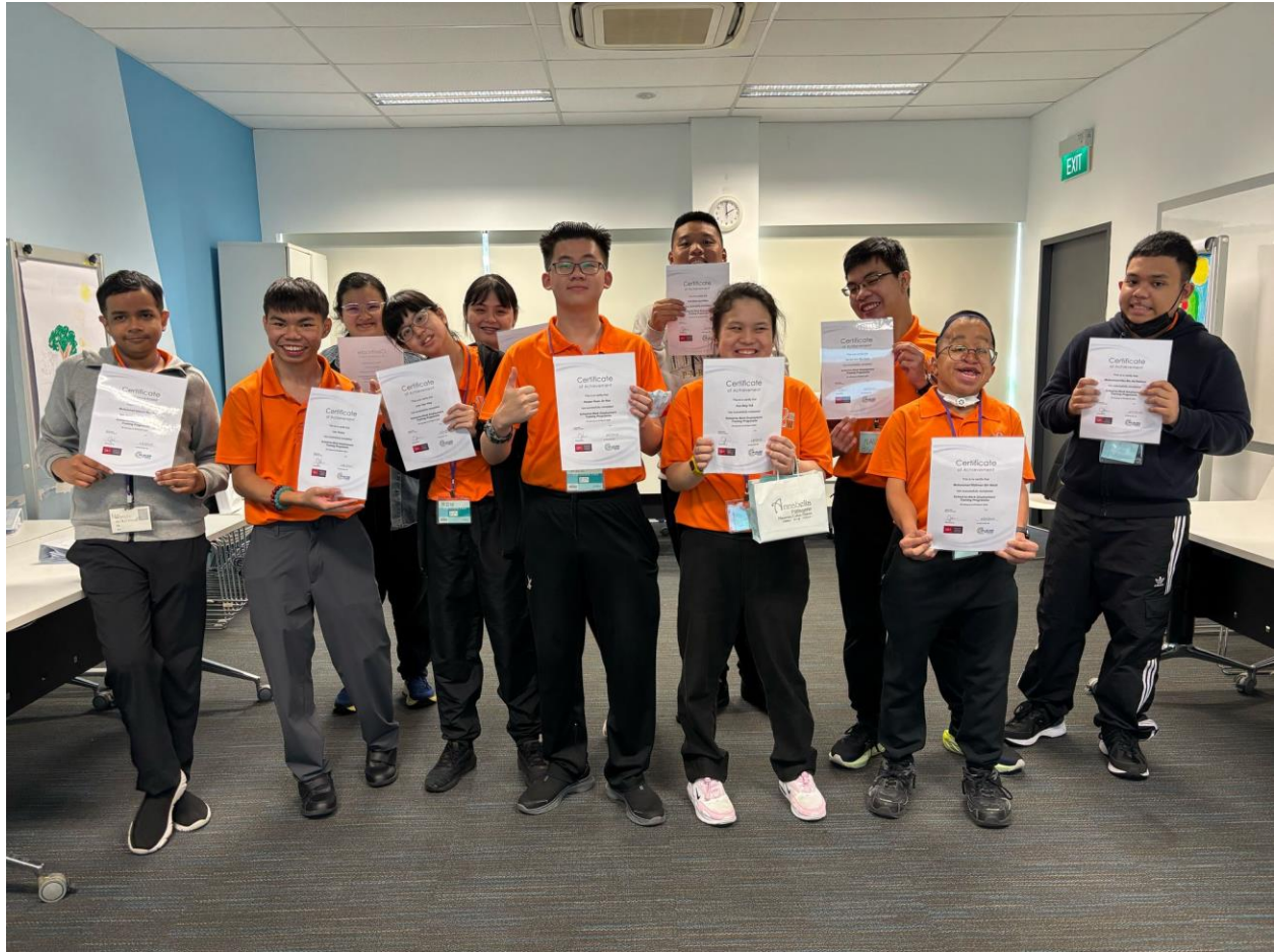
Image caption: Special education school graduands of the School-to-Work Transition Programme.