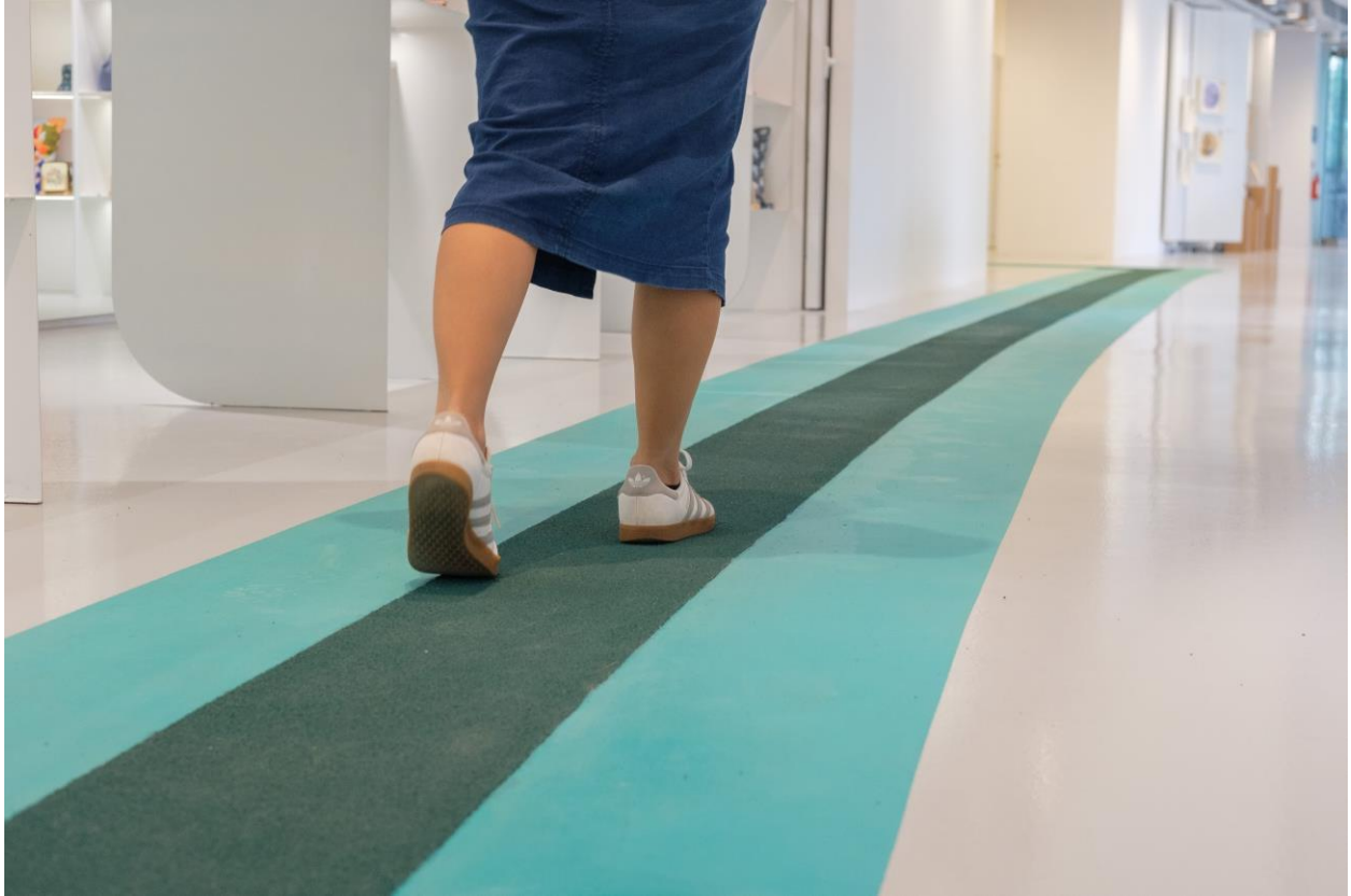
Image caption: The Enable Lane is a central textured pathway that ensures accessibility for visual and physical needs. Its high contrast, tactile surface aids those with visual impairment, while its smooth surface allows wheelchair users to navigate with ease from Redhill Road to Jalan Bukit Merah.